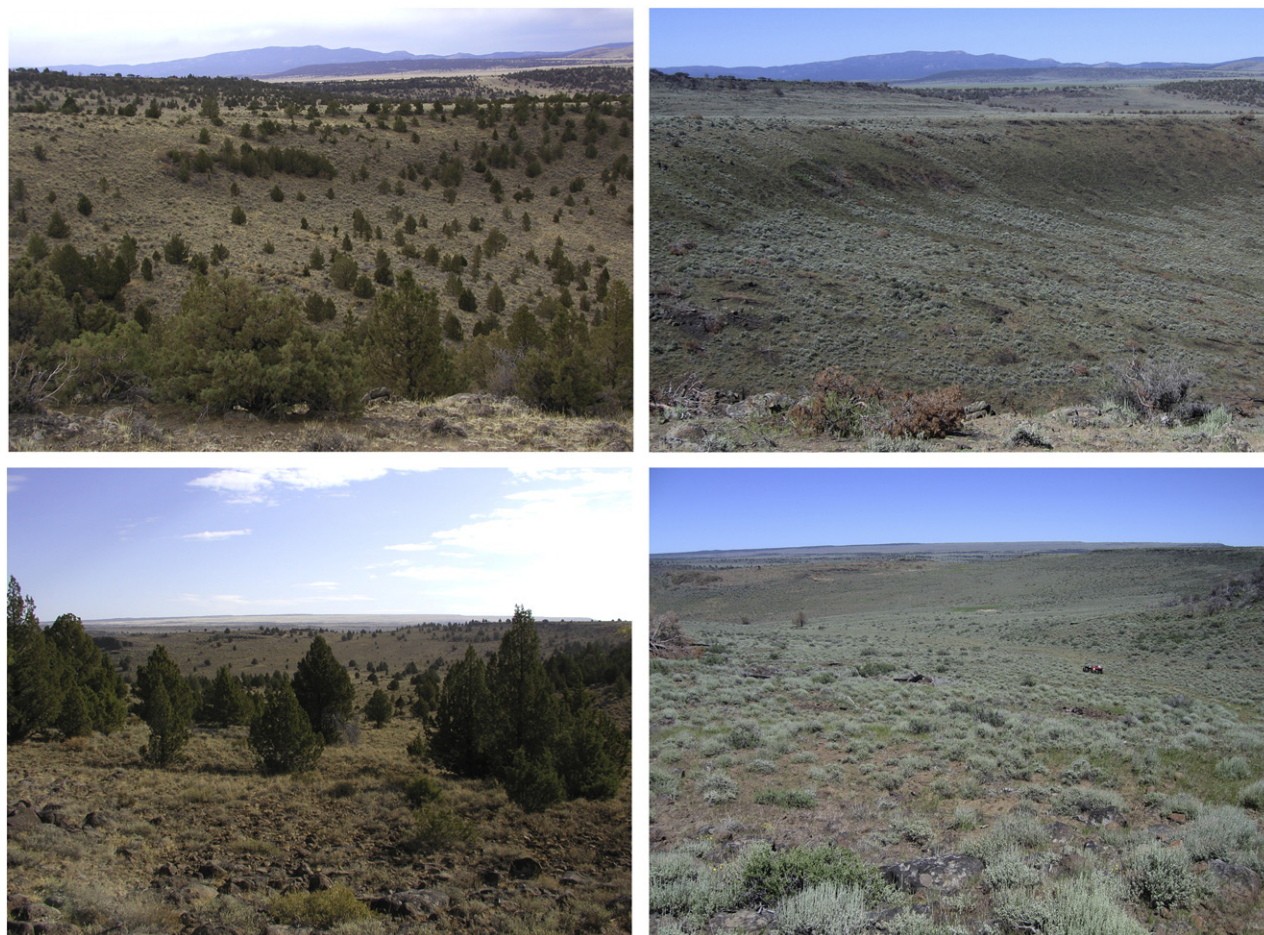
Figure 1. Two portions of the South Warner Project Area before treatment in 2008 (left) and after (right, 2015) hand felling of Phase II juniper trees.