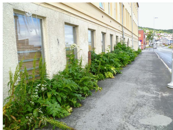
Figure 1. Tromsø palm growing along the wall of a house in Tromsø city, August 2012.

Tromsø palm ( Heracleum persicum ) belongs to the family of Apiaceae (Lid and Lid 2005). It has a 1- to 4-cm-wide hollow stem with purple-red spots; the lower part of the stem is often completely purple-red. The plant can grow to 1- to 4-m high (EPPO/OEPP 2009; Often and Graff 1994). It produces