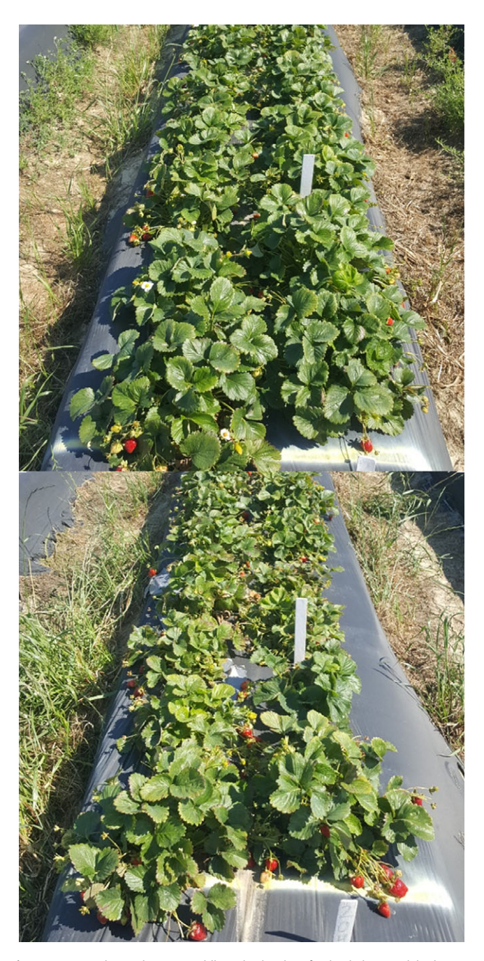
Figure 1. 2,4-D directed to row middle on both sides of polyethylene-mulched strawberry. Nontreated (left) and 2,4-D at 1.06 followed by 1.06 kg ha^{-1} (right) 8 wk after sequential application.