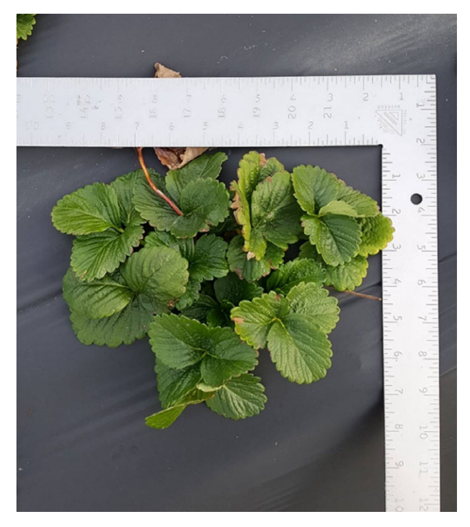
Figure 2. Strawberry canopy measurements determined by measuring the widest part of the plant canopy and then the width perpendicular.

30 d before transplanting (Boyd and Reed 2016). The study confirmed the same results for EPTC, fomesafen, halosulfuron (5 and 10 g ai ha<sup>-1</sup>), EPTC plus S-metolachlor (229 + 107 g ai ha<sup>-1</sup>), fomesafen plus S-metolachlor (42 + 107 g ai ha<sup>-1</sup>), and napropamide plus oxyfluorfen when applied to the bed surface after fumigation and before plastic mulch was laid. Research has been conducted to evaluate clopyralid applied POST during fruiting to control weeds in the planting hole. Hunnicut et al. (2013) observed foliar injury <5% and up to 37% from clopyralid at 66 (maximum registered rate) and 261 g ha<sup>-1</sup> POST, respectively. However, in the same study, marketable yield was 104% and 98% from strawberry treated with 66 (maximum registered rate) and 261 g ha<sup>-1</sup> clopyralid, respectively, compared to the nontreated control. Clopyralid treatments were also compared to 2,4-D amine POST over strawberry grown on polyethylene mulch to determine efficacy on vetch and strawberry tolerance (McMurray et al. 1996). In these studies, strawberry exhibited ≤6% injury from all clopyralid treatments, and 2,4-D caused 5% and 12% injury when applied to strawberry in the 7- to 9- and 9- to 10-lf stages, respectively, and