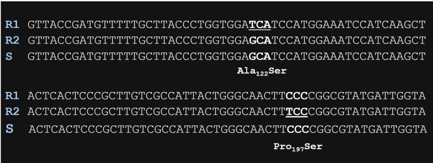
Figure 2. Two ALS gene mutations conferring ALS-inhibitor resistance in Persicaria pensylvanica . The underlined nucleotides (TCA and TCC) code for the amino acid serine instead of an alanine and proline at two different locations (122 and 197) of the ALS gene. R1, R2, and S refer to two resistant and one susceptible individuals, respectively.