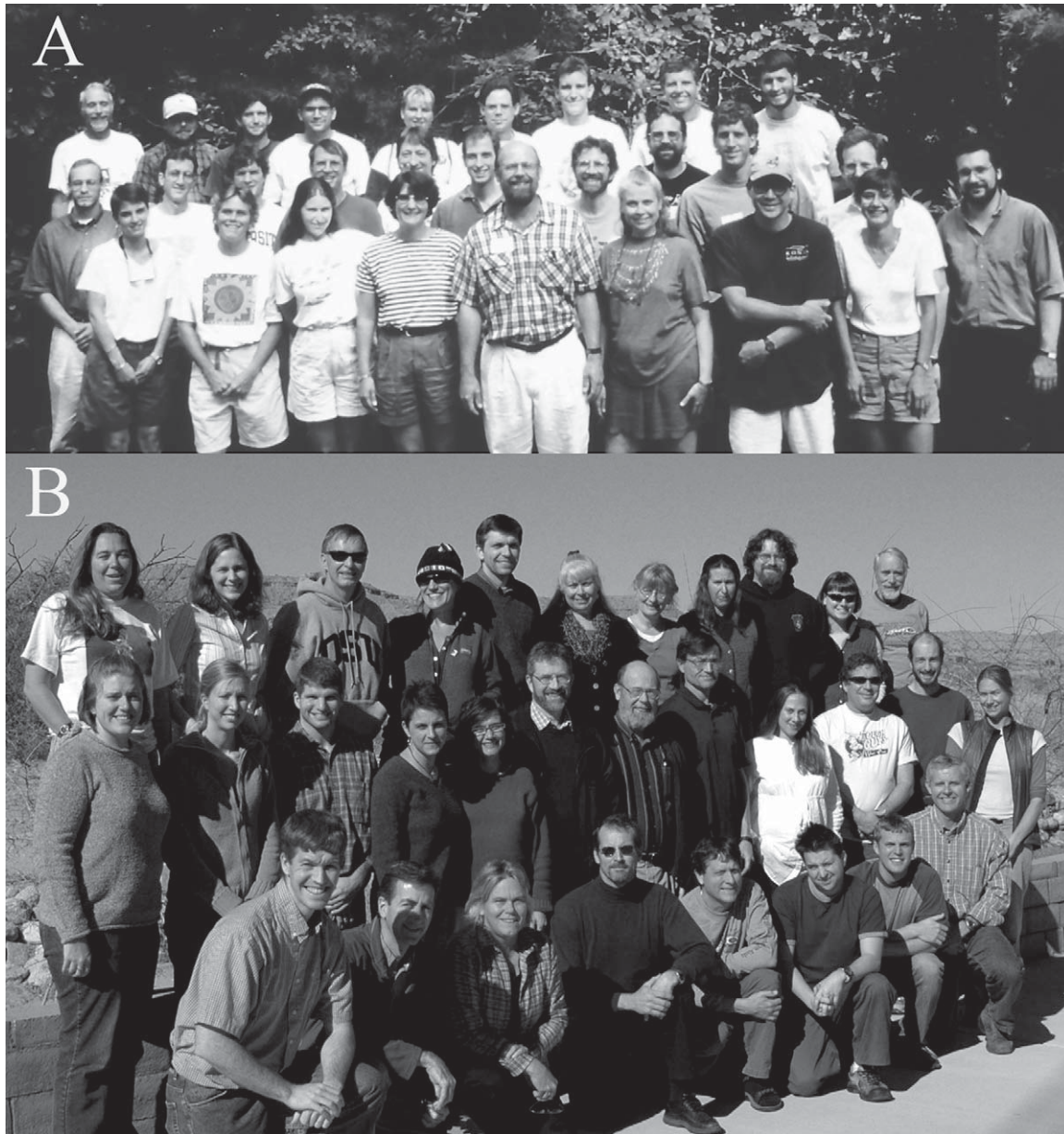
Figure 3. A.—Preliminary group of collaborators at Coweeta Hydrologic Laboratory in 1995 that led to formation of the LINX I group. B.—Lotic Intersite Nitrogen eXperiments (LINX) II collaborators at a synthesis workshop at the Sevilleta long-term ecological research site (LTER) near the end of the experiment in November 2006.

proach, which included whole-stream ^{15}\text{N} -tracer experiments bolstered by other ecosystem measurements, a cross-site comparative design, and integration of modeling and empirical approaches, also added to its appeal.