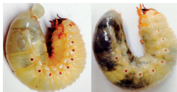
Fig. 1. Comparison of a diseased larva with viral infection (left) and a healthy larva (right). Diseased larva appears beige and milky, and its rectum is prolapsed. The abdomen of the diseased larva swells up, and the body is very soft.

The viral DNA fragment amplified by AdV-F1/R1, -F2/R2, and -F3/R3 was isolated from agarose gel, and DNA sequences were determined with an Applied Biosystems 3730xl DNA Analyzer (MacroGen, Seoul, Korea). Blast search with OrNV genome (NC_011588) revealed that the three sequences have 98%, 98%, and 99% identical to corresponding OrNV genes, respectively.