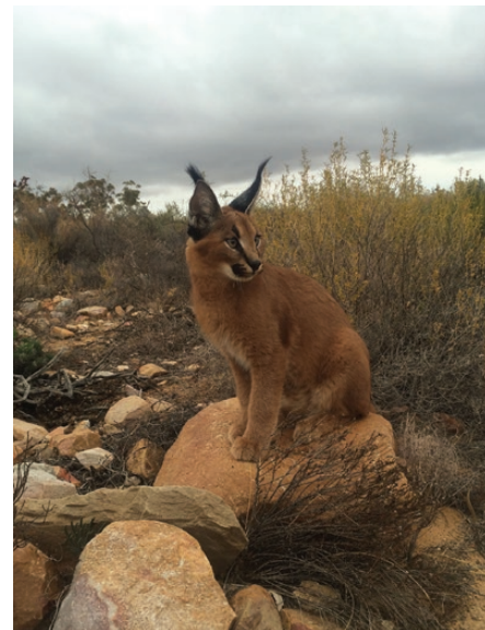
Fig. 1. —Subadult Caracal caracal from Anysberg Nature Reserve, South Africa.

CONTEXT AND CONTENT. Order Carnivora, suborder Feliformia, family Felidae, subfamily Felinae. The genus Caracal includes the following two species: Caracal aurata (formerly Profelis aurata ) and C. caracal (Kitchener et al. 2017).