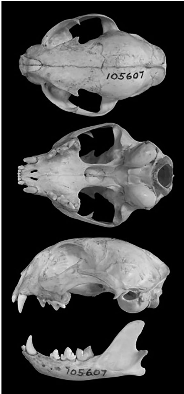
Fig. 3. —Dorsal, ventral, and lateral views of skull and lateral view of mandible of an adult female Caracal caracal (FMNH [Field Museum of Natural History] 105607) collected by H. H. Hoogstraal (collector # 13919) on 9 December 1972 at Africa, Sudan, Kassala, Ethiopian: Kassala, Abu Gamal. Total skull length is 103.52 mm. f8e611ef-14e0-431f-acd8-8955c8521c97 Field Museum of Natural History (Zoology) Mammal Collection. https://collections-zoology.fieldmuseum.org/catalogue/2604376 .

2010). Females likely do not begin mating until 14 months of age and can remain reproductive until 18 years of age (Furstenburg 2010). Females are polyestrous and estrus cycles last anywhere from 1 to 6 days (Nowell and Jackson 1996).