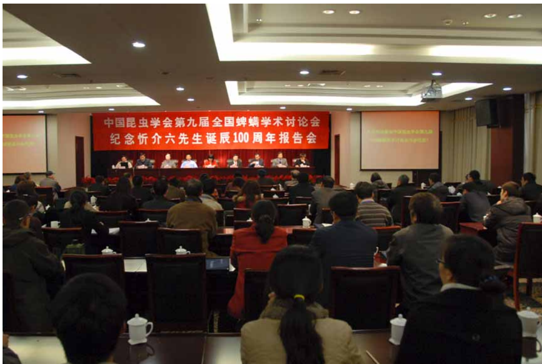
FIGURE 2. The opening session of the Symposium Commemorating the Centenary of Prof Jie-Liu Xin's Birth during the 9th National Congress of Acarology organized by the Entomological Society of China (Nanjing Agricultural University, 28 Nov. 2009).