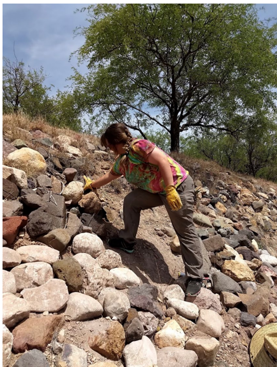
Image 2. BECY team member with rock structure.

During the summer of 2019, BECY Institute celebrated the eighth year of programming. Since it began, BECY interns have built more than 2,000 erosion control structures across three