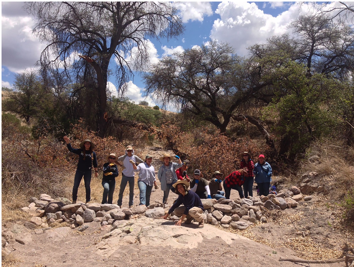
Image 1. BECY crew with rock structure.