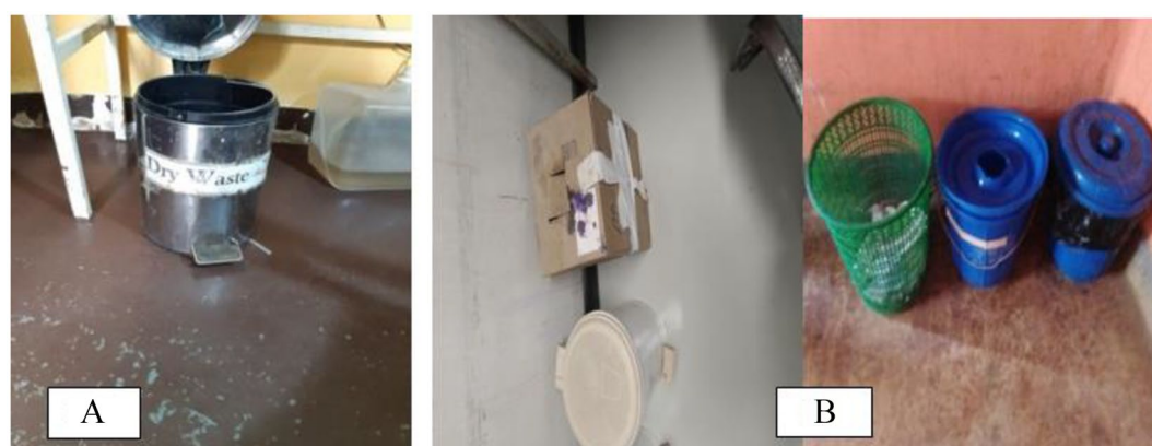
Figure 1. Photos to show (A) good waste collection and segregation bins and (B) improper waste collection and segregation bins.