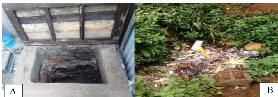
Figure 5. Sample photos of (A) substandard placenta pit and (B) open field disposal of wastes.