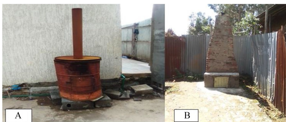
Figure 4. Sample photos of (A) unacceptable incinerator and (B) acceptable incinerator used to treat dry and infectious wastes.