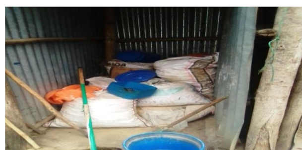
Figure 3. Sample photo of not well fenced waste storage practice.

feedback from regulatory bodies were the significant predictor for proper healthcare waste management practices in private clinics. This finding is supported by studies done in India. 34,35 This might be because of the fact that both supportive supervision and presence of guidelines increased the knowledge and adherence of health professionals for waste management.