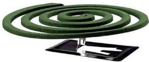
Plate 1. A typical spiral-shaped mosquito coil.

When a mosquito coil is burnt, it emits repelling incense that keeps away mosquitoes. The coil usually contains an active ingredient which may vary from one brand to another. It is commonly made into a paste that is dried and given spiral shape as shown in Plate 1. The coils are used widely in the developing countries including Nigeria to repel and kill mosquitoes most especially in the summer when hot weather aids their breeding in large quantities. 14,17 Emissions from mosquito coils have been linked with release of harmful pollutants. 14,16 This is even more worrisome and of great concern as humans are at the risk of being exposed to high toxic loads of the pollutants because they are usually released into indoor environment which in most instances have poor ventilation and the pollutants from their ashes into outdoor environment (soil and water bodies). Different brands of mosquito coils (imported or Nigerian made) are available for use in Nigerian markets. These coils are usually burnt at night in the bedrooms while household members sleep.