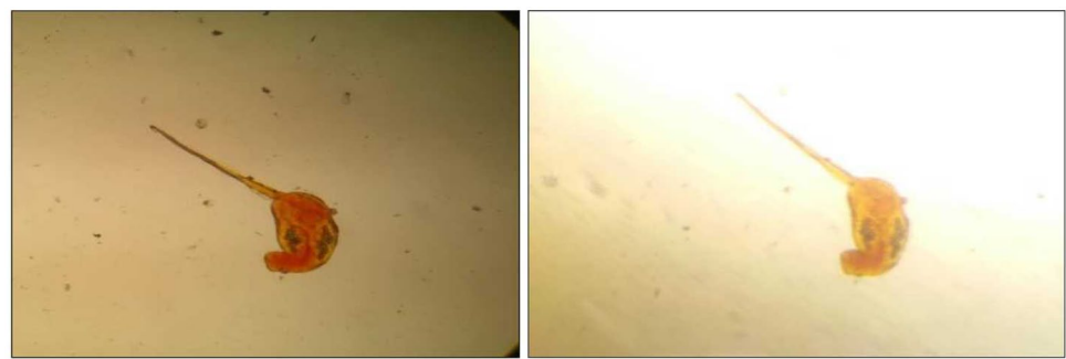
Figure 3. Image of Echinostome cercariae shed by Bulinus snails, Alwero Dam reservoir, Ethiopia.