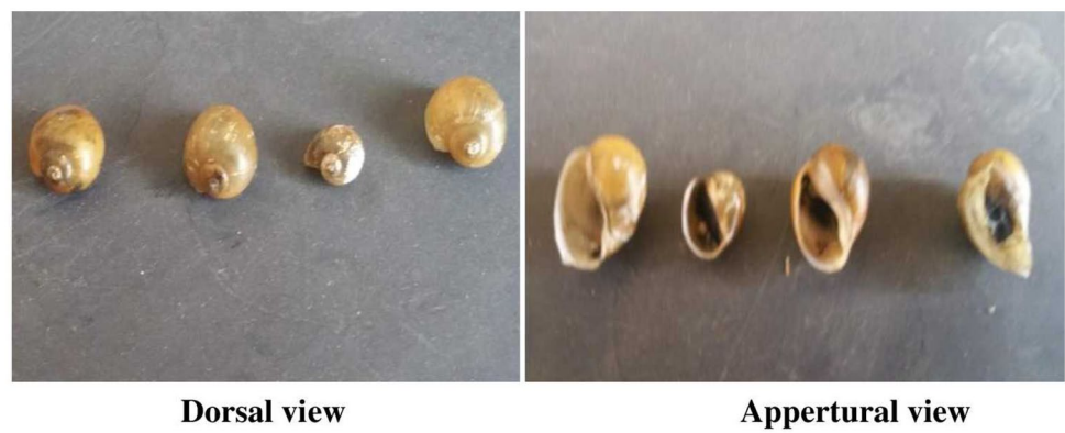
Figure 2. Shell of Bulinus snails (collected at Alwero Dam reservoir, Ethiopia).