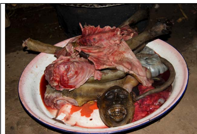
Fig. 3. Sykes monkey on the menu. Photo by M.R. Nielsen taken in one of the villages surrounding NDUFR.

Elephants, buffaloes, lions, and hyenas were recorded only in WKSFR. Medium-sized species (>16 kg) such as bush pig, Abbott's duiker, and armadillo were significantly less abundant in both hunted areas. Smaller ground-living species had the lowest relative density in the area with the highest level of hunting, while two of three primate species were approximately equally abundant in the two hunted areas. To protect the astounding biodiversity of WKSFR, the Ndundulu, and Nyanbanitu forests and the adjacent Matundu and Iyondo forest reserves have recently been gazetted as the Kilombero Nature Reserve [62]. The status as nature reserve is the highest protection under the Tanzanian Forestry and Beekeeping Division legislation, equivalent to the National Park status of the Tanzania National Parks Authority.