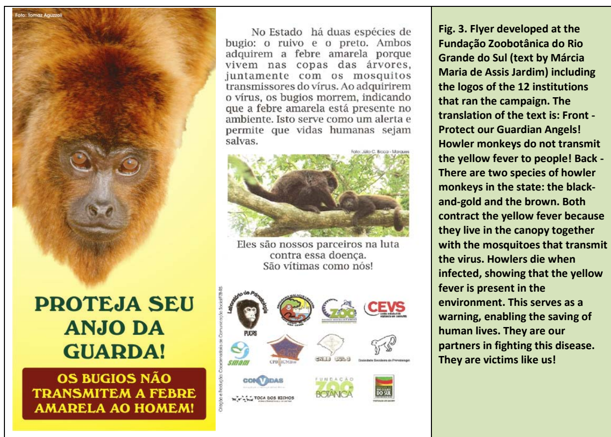
Fig. 3. Flyer developed at the Fundação Zoobotânica do Rio Grande do Sul (text by Márcia Maria de Assis Jardim) including the logos of the 12 institutions that ran the campaign. The translation of the text is: Front - Protect our Guardian Angels! Howler monkeys do not transmit the yellow fever to people! Back - There are two species of howler monkeys in the state: the black-and-gold and the brown. Both contract the yellow fever because they live in the canopy together with the mosquitoes that transmit the virus. Howlers die when infected, showing that the yellow fever is present in the environment. This serves as a warning, enabling the saving of human lives. They are our partners in fighting this disease. They are victims like us!