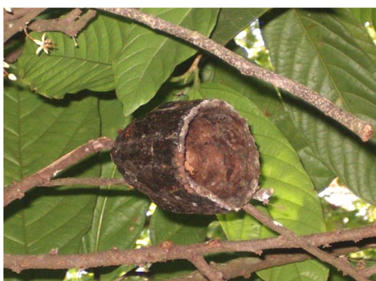
Fig. 2: Evidence of feeding by red-tailed monkeys on the pods on a cocoa tree cocoa in the plantation at Kituza Research Station, Uganda

Red-tailed monkeys in the social group ranged most frequently in plots close to the forest edge, while solitaires ranged more extensively. Hence, cocoa pods in plots near the forest edge were more damaged by social groups than those far away ( r = 0.61 , P < 0.05 , N = 12 plots). Furthermore, plots farthest from the road suffered higher damage than the corresponding plots near the road ( paired t-test = 3.675, P=0.001 ). On the other hand, adult solitary males were sighted more frequently in plots distant from the forest edge ( r = -0.828 , P < 0.001 ; N=12 plots), and consequently, the pod damage caused by solitaires increased with distance from the forest edge ( r = 0.745 , P < 0.008 ).