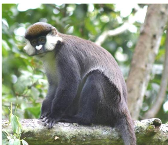
Fig. 1: A red-tailed monkey from Uganda.

A single social group of 19 to 20 members and two solitary males (one adult and one immature) raided the cocoa plantation. Mean monthly raiding subgroup size varied throughout the study (mean = 12.5; range = 7 to 16; Fig. 3) though at times the whole social group entered the cocoa field to raid. Mean monthly raiding subgroup size was related to the total number of pods damaged ( r = 0.538 , P < 0.05 , N = 10 months). However, daily pod damage was negatively correlated to raiding subgroup size ( r = -0.683 , P < 0.05 ), implying greater involvement of solitary males in raiding. Given the secretive nature of crop-raiding, red-tailed monkey group counts should be considered cautiously as they are likely underestimates; however, any bias this would create would only increase the difference between animals in social groups versus solitary animals.