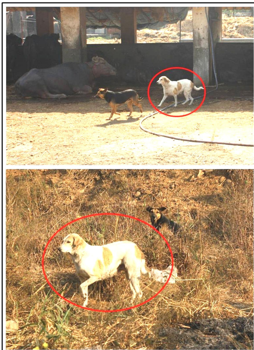
Fig. 2. The image indicates photographs obtained for a distinct naturally marked dog over two secondary sampling intervals in Aarey Milk Colony, India.

[34]. This is similar to Bowden's estimator in the NOREMARK program [24]. As marks were individually identifiable, we used individual heterogeneity models with the data, since we expected individual dogs to have differential sighting probabilities. We used the time-constant models, with or without individual heterogeneity parameters. Since some convergence issues occurred for values of \sigma (individual heterogeneity parameter) for the time-constant model with heterogeneity, we manually supplied initial values covering the probable range of parameters in the three models. We also used other options to overcome convergence issues for values of \sigma , such as the 'Alt.Opt.method' and 'Do not standardize design matrix' in another two models. In all we used seven time-constant models, the first six of which represented the time-constant model with individual heterogeneity, with various options as described above. The last model represented the time-constant model without the individual heterogeneity parameter (where \sigma was fixed to zero). Model comparison was performed in an information-theoretic framework using Akaike's information criteria corrected for small sample size (AICc).