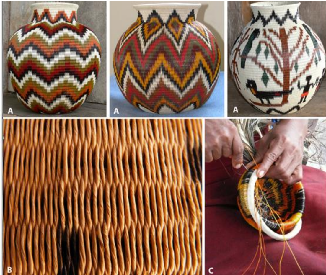
Fig. 4. Baskets currently woven by the Wounaan. A, baskets; B, detail, C, weaving process.

of us (RB) took part in field activities in May 1998 at Pichimá, where the easy use of the medialuna and its obvious advantage over the traditional harvest technique generated immediate acceptance.