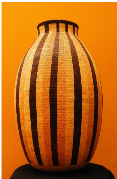
Fig. 5. Early Wounaan basket woven with the Botswanan technique ca. 1988. Personal collection of Aida Palacios.

Therefore, it is remarkable how quickly the Wounaan appropriated the new variation of their traditional technique, and how deeply they enriched it with their own cultural patterns. So deeply, indeed, that the new baskets became a signature of their people and a major source of cash income for most Wounaan households.