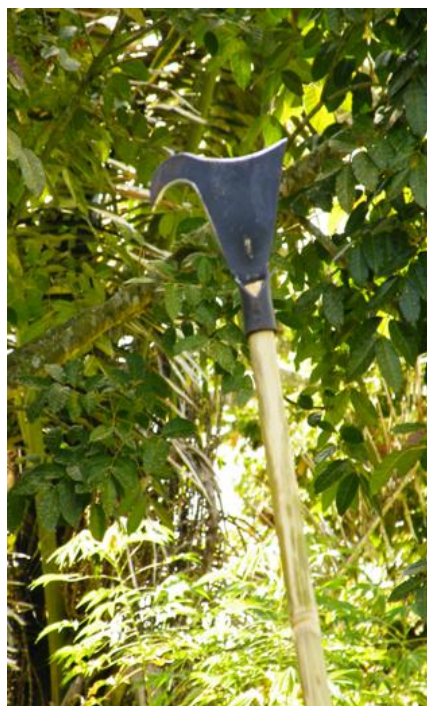
Fig. 6. Detail of the medialuna used for harvesting spear leaves of Astrocaryum standleyanum in western Colombia.