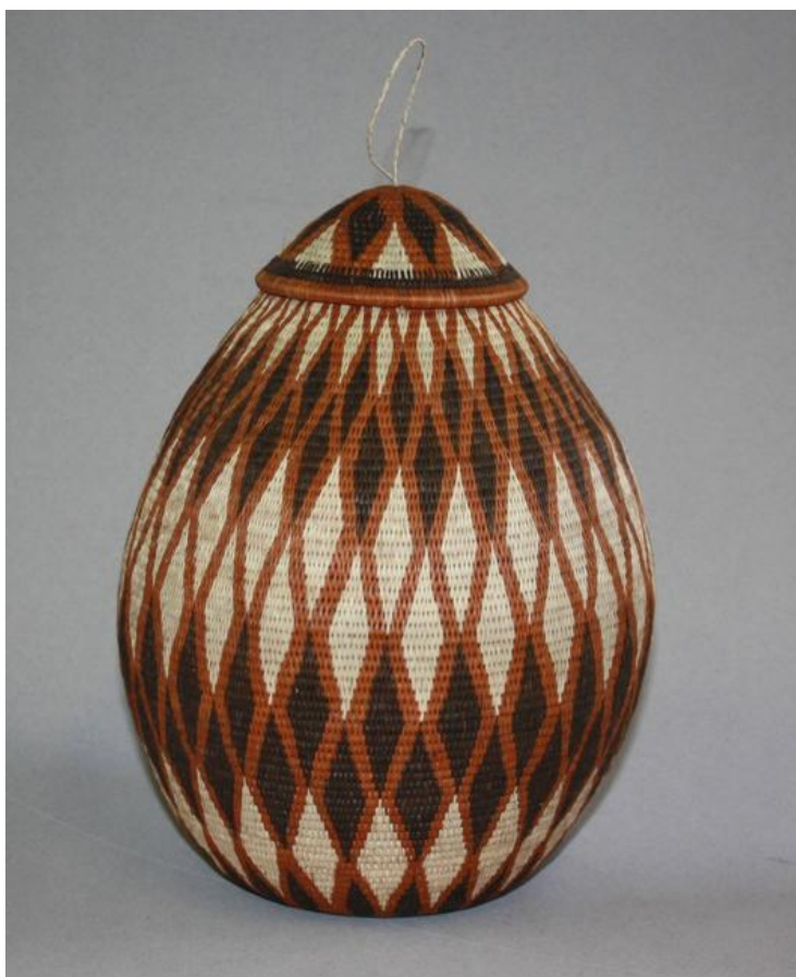
Fig. 3. Basket woven by the Ba Yei and HaMbukushu of Botswana, 2012.

the start of the A. standleyanum basket boom. Within a few years the Wounaan baskets had gained a reputation among Colombian handicrafts, and by the early 1990s they fetched high prices in handicraft shops in Bogotá [16] and had even reached shops in New York (R. Bernal, pers. obs.).