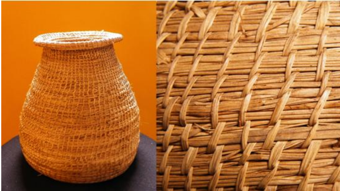
Fig. 2. Traditional basket woven by the Embera at the Pacific coast of Colombia in the mid-1980's, with a detail of its stitches. Baskets similar to this one were woven also by the Wounaan, as recorded by one of the authors. Personal collection of Aida Palacios.

In the traditional Wounaan baskets each stitch passed either through the fiber of the previous stitch (Figs. 1C), or through the foundation of the previous coil (Fig. 2); in the latter, the stitches were widely separated from one another, so that the foundation was visible. Furthermore, the foundation's fiber strand was naked. In the Botswanan technique the foundation is wrapped in fiber, resulting in a solid coil (Fig. 4C); each stitch completely surrounds the current coil and the previous one (Fig. 4B-C), and the stitches are so tight that the foundation is not visible. This technique is not exclusively Botswanan but is also found in such remote areas as Thailand and the Pacific coast of North America [12].