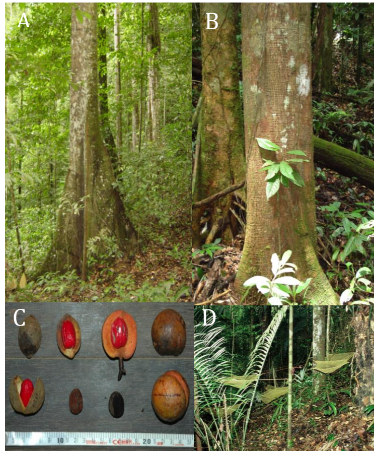
Fig. 2: Virola trees (A : V. kwatae ; B: V. michelii ) fruits and seeds (C : V. michelii , left; V. kwatae , right) and litter traps (D) underneath a V. michelii tree crown in Guianan rainforests.

The avian community includes 157 frugivorous or granivorous species. Large canopy frugivorous birds (e.g. toucans, guans) are common. There are 45 species of arboreal and flying frugivorous mammals [49]. Red howler monkeys ( Alouatta seniculus ), capuchins ( Cebus olivaceus and C. apella ) and black spider monkeys ( Ateles paniscus ) dominate in terms of primate biomass.