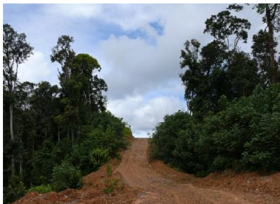
Fig. 2b. Piper aduncum remains absent along the new road in northern part of the concession

Regarding branch roads, P. aduncum occurred along Road “a” (constructed in 1997) but was absent on road “b” (constructed in 1998) where maintenance activities (including the slashing of plants on the edge of road) were being undertaken in preparation for timber extraction. In addition, we recorded two localized occurrences of P. aduncum on road “c” (constructed in 2006) leading to Mahak Village. These occurrences are at a direct (linear) distance of 82 and 88 km (and 148 and 155 km measured along the road) from Long Bagun at “Km 0”.