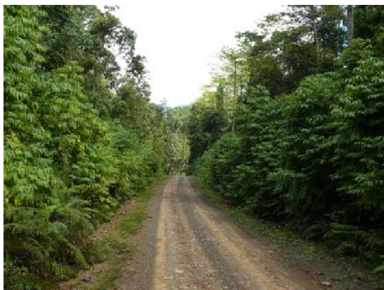
Fig. 2a. The dense cover of Piper aduncum along the old road in southern part of the concession