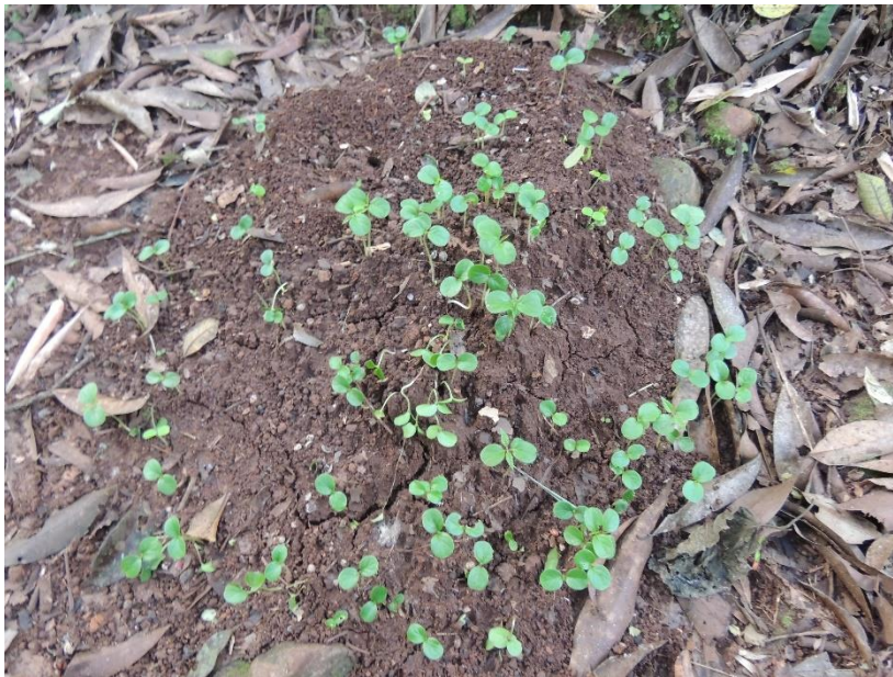
Fig. 6. Abandoned ant nest with germinating Hovenia dulcis seedlings.

seedlings of the raisin tree were growing was found (Fig. 6); however, determining the ant species to which this nest belonged was not feasible, as it had been abandoned [54].