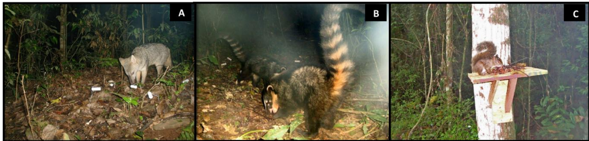
Fig. 3. Cerdocyon thous (crab-eating fox) (A), Nasua nasua (South American coati) (B) and Guerlinguetus ingrani (southeastern squirrel) (C), consumers of Hovenia dulcis recorded by camera traps in seasonal deciduous forest fragments in the Fritz Plaumann State Park (Brazil). In "C", suspended tree platforms were used to record arboreal animals.

The total number of seeds found in feces was 73, and the largest fecal sample with the highest number of seeds (n=53) belonged to a crab-eating fox that consumed both fruit and peduncle. No difference was found in seed germination between seeds obtained from fecal samples and those in the control group ( \chi^2=0.23 , p=0.63 , df=1 ). This suggests that the passage of seeds through the digestive tracts of animals does not influence seed germination of the raisin tree. Because the seeds in the feces were both intact and germinated, this species may be considered a seed disperser of the raisin tree.