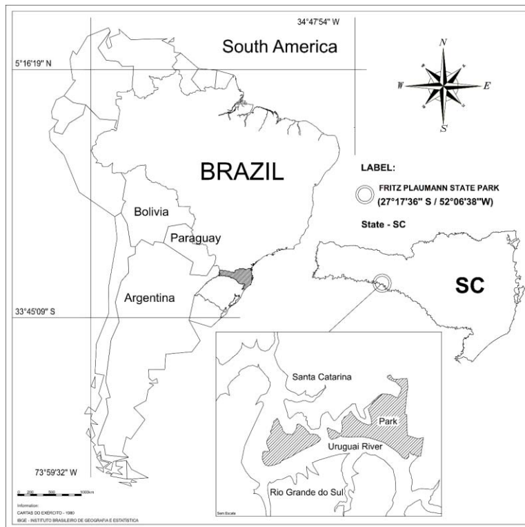
Fig. 1. Location of the Fritz Plaumann State Park, Santa Catarina state, southern Brazil [extracted from 25].