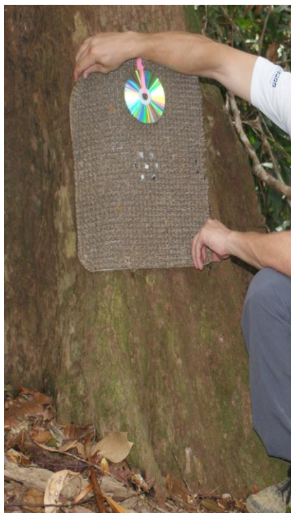
Fig. 2. An example of one of the scent-baited hair traps used in the study, designed to target felids.

For the first design we attached traps to the ground to target Dholes ( Cuon alpinus ), the only canid known to be present in the landscape; studies conducted on other canids such as Dingoes ( Canis dingo ) in Australia successfully obtained hair samples using this design [18, D. Marrant, unpublished data]. For the second design, we attached traps to trees (Fig. 2), targeting six known felids in the landscape: the Malayan tiger ( Panthera tigris jacksoni ), leopard ( Panthera pardus ), clouded leopard ( Neofelis nebulosa ), golden cat ( Pardofelis temminckii ), leopard cat ( Prionailurus bengalensis ) and marbled cat ( Pardofelis marmorata ). The rationale for placing traps on trees was to prevent the traps from appearing as 'foreign ground objects' to felids, and to facilitate cheek, head, and neck rubbing, which are commonly observed scent-marking behaviours in felids [19,20]. A blank compact disc (CD) was added approximately 10-30 cm above the scent packet as a visual attractant [sensu 21].