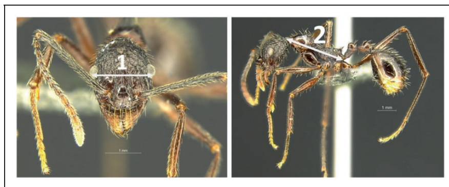
Figure 2. Vectors presenting the ant body measurements taken in mm. (a) Head width (HW) and (b) Weber's length (WL).