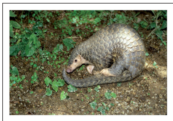
Figure 1. Picture of a wild Chinese pangolin ( Manis pentadactyla ) in Hong Kong.

We used previous data from extensive ant surveys conducted in Hong Kong (Fellowes, 1997) to calculate ant species occurrences in different habitats and used these as proxies for their local abundance and habitat association. Here again, taxonomy was updated through direct