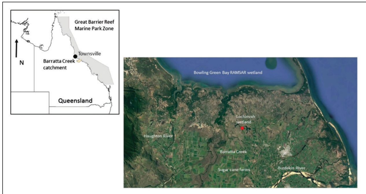
Figure 1. Location map of Barratta wetland, Burdekin River delta, north Queensland, Australia.

critical for floodplain protection (Burrows et al., 2012). In this study, we examine wetland water quality conditions before and after aerial spraying, and in doing so determine the exposure risk to fish, particularly DO conditions and water temperature. This study provides data for managers to evaluate wetland system repair projects in the GBR catchments, but these data have broader relevance given the global infestation of invasive aquatic weeds in coastal wetlands (Villamagna & Murphy, 2010).