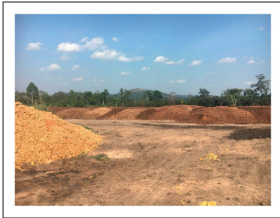
Figure 1. Orange peels gathered for disposal in Ghana.

products, these ventures are often capital-intensive or yield products with limited markets, conditions that may prevent widespread adoption in tropical developing nations. In the case of our study, it was largely the costs of turning the orange peels into a benign product, in this case cattle feed, which drove interest in the waste disposal contract with ACG (Daniel Janzen (DJ), occurring in July 2016, personal communication). After media coverage of our study, we were contacted by numerous citrus growers interested in exploring similar arrangements, suggesting that for this particular type of waste, lucrative markets for waste derivatives are not universal and alternative disposal costs are high (Figure 1).