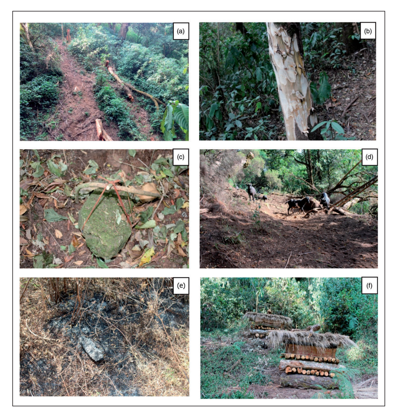
Figure 3. Photographs of signs of various human activities in the KICF recorded during the study: (a) felling, (b) debarking, (c) snare, (d) grazing, (e) fire, and (f) beehives.

whose occurrence is favored by their high canopies. Forest management must be shared among traditional authorities, local communities, and MINFOF (Thomas et al., 2000); however, MINFOF has been weak in her role of law enforcement and monitoring.