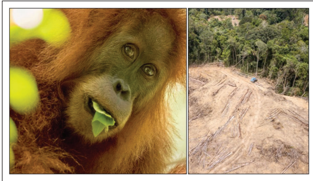
Figure 2. The critically endangered Tapanuli orangutan and the clearing of its habitat in preparation for the Batang Toru hydroelectric project in northern Sumatra.

they are largely incompatible with this project. Infrastructure development and flooding would isolate ~25% of the species into nonviable communities and destroy prime habitat of the sole viable community in the West Block fragment (Wich et al., 2019).