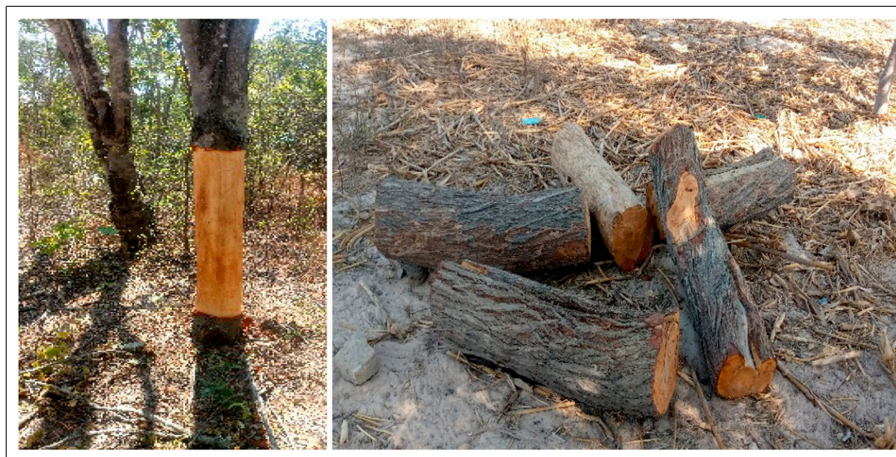
Figure 3. Debarking and cutting down trees for log or bark beehive construction.