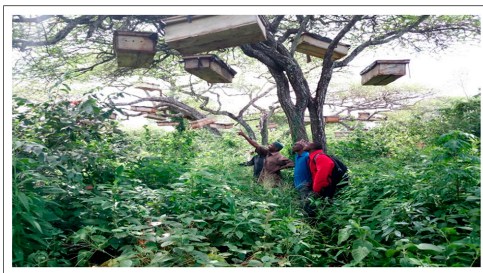
Figure 2. An apiary with hanging frame beehives covered by vegetation.

adoption of the hanging frame hives technology in the region. Moreover, many factors were contributing to community preference for log beehives. The focus group discussions revealed that hanging frame beehives were expensive compared to log beehives. A hanging frame beehive was priced from TZS 80,000 to TZS 120,000 (34.45–51.68 USD), which hindered beekeepers from adopting and using the technology. Apart from the perceived high costs of hanging frame beehives, tradition was another important aspect mentioned during discussions. It was further revealed that tribes such as Sandawe and Rangi preferred to use log beehives due to their cultural values and norms, such that traditional beekeeping is a way of honouring ancestors. The system has become part of their daily family life, making it difficult to adopt hanging frame beehives as it will go against their norms. These ethnic groups are