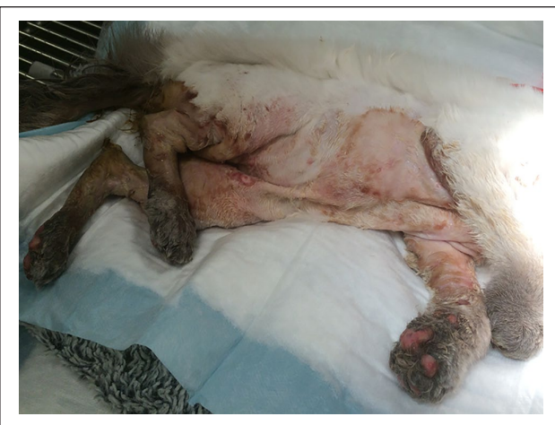
Figure 4 Necrosis of skin lesions prior to debridement on day 8 of hospitalisation

Dyspnoea developed on day 15 of hospitalisation and the kitten was placed in an oxygen kennel set at 60% fraction of inspired O 2 . Thoracic radiographs identified cardiomegaly without infiltrative pulmonary disease. Point-of-care ultrasound identified diffuse pulmonary B lines on day 16 of hospitalisation. Pulmonary B lines are associated with peripheral interstitial–alveolar disease of varying aetiology. 13 Acute respiratory distress syndrome was suspected, although thromboembolism or aspiration pneumonia could not be excluded. The respiratory signs resolved within 7 days of occurring and oxygen therapy was de-escalated.