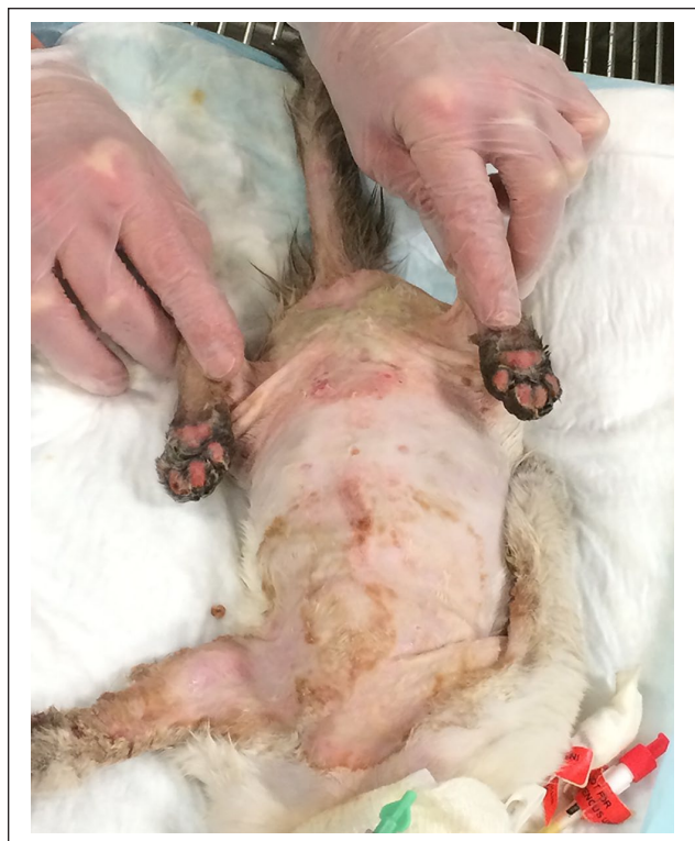
Figure 3 Progression of the deep partial thickness (second degree) burns on day 4 of hospitalisation

underlying structural disease or changes consistent with endocarditis. The murmur was deemed to be haemic secondary to anaemia (Table 1). Cardiac troponin I was mildly increased (0.4 ng/ml; RI <0.04). The mild increase in cardiac troponin I concentration was attributed to myocardial injury related to systemic inflammation.