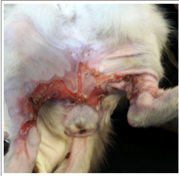
Figure 5 Incomplete healing of skin lesions 5 days after discharge from the hospital

Plan Kitten) and increase the amount of food offered if there was a decrease in body weight. Body weight was 1.4 kg vs 1.53 kg on admission. BCS was 3/9 vs 4/9 on admission and the muscle condition score had decreased from 2/3 to 1/3.