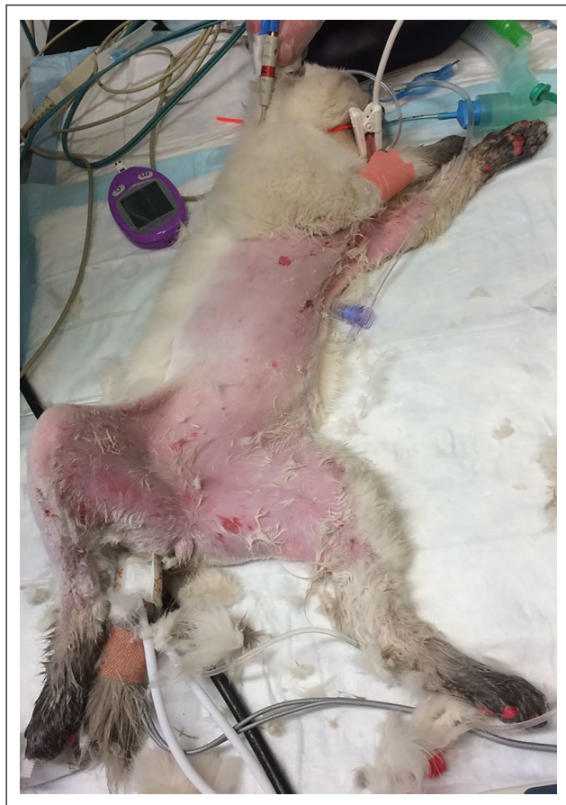
Figure 1 Clipping of the haircoat following admission revealing scalding and erythema of the ventral thorax, abdomen, thoracic/pelvic limbs and perineum with areas of ulceration

Haematology and biochemistry panels sampled on admission revealed a non-regenerative mild anaemia, neutropenia, hypoalbuminaemia, hypocholesterolaemia and increased alanine aminotransferase (ALT) activity (Table 1). On day 2, the kitten remained pyrexial at 39.9°C. The urinary catheter was removed and the central venous catheter was replaced as it had been removed by the patient. Pyrexia persisted despite new vascular access. No erythema or discharge of the O-tube site was detected on daily assessment. Urinalysis indicated no evidence of urinary tract infection and urine culture demonstrated no microbial growth. IV potentiated amoxicillin 20mg/kg q8h (Augmentin; GlaxoSmithKline) was initiated on day 3.