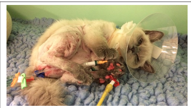
Figure 2 Enteral nutrition was administered by constant rate infusion via the oesophageal feeding tube

On day 3, the kitten started to eat small quantities of kitten food (Hill's Science Plan Kitten) when offered by hand. The calories ingested voluntarily were minimal and O-tube feeding continued at 100% of the calculated RER. Neutropenia resolved on day 4 (Table 1); however, the pyrexia persisted, with the rectal temperature fluctuating between 39.3°C and 40.5°C. In the absence of documented