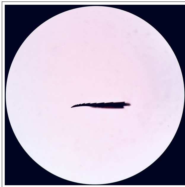
Figure 2 Bee stinger observed under an optic microscope, with a sharp triangular shape and multiple barbs

Considering the high risk of migration of the FB into the anterior chamber (AC) and despite the recent improvement in ocular comfort, the removal of the FB was performed under general anaesthesia using a surgical microscope (OMS 600; TOPCON).