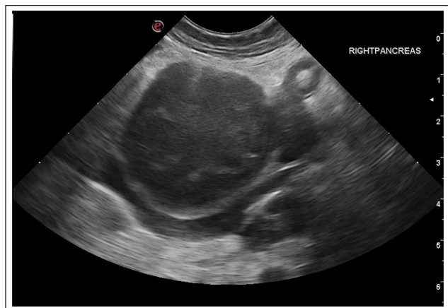
Figure 1 Ultrasound image of one of the pancreatic cystic structures at the time of diagnosis. Large, spherical structure filled with anechoic fluid within the hypoechoic pancreas

Animal Health) had been started. At the time of referral, the patient was receiving 6 IU in the morning and 1 IU in the evening. The owner reported that the patient's appetite had improved slightly since starting treatment; however, PU/PD persisted and the patient continued to lose weight.