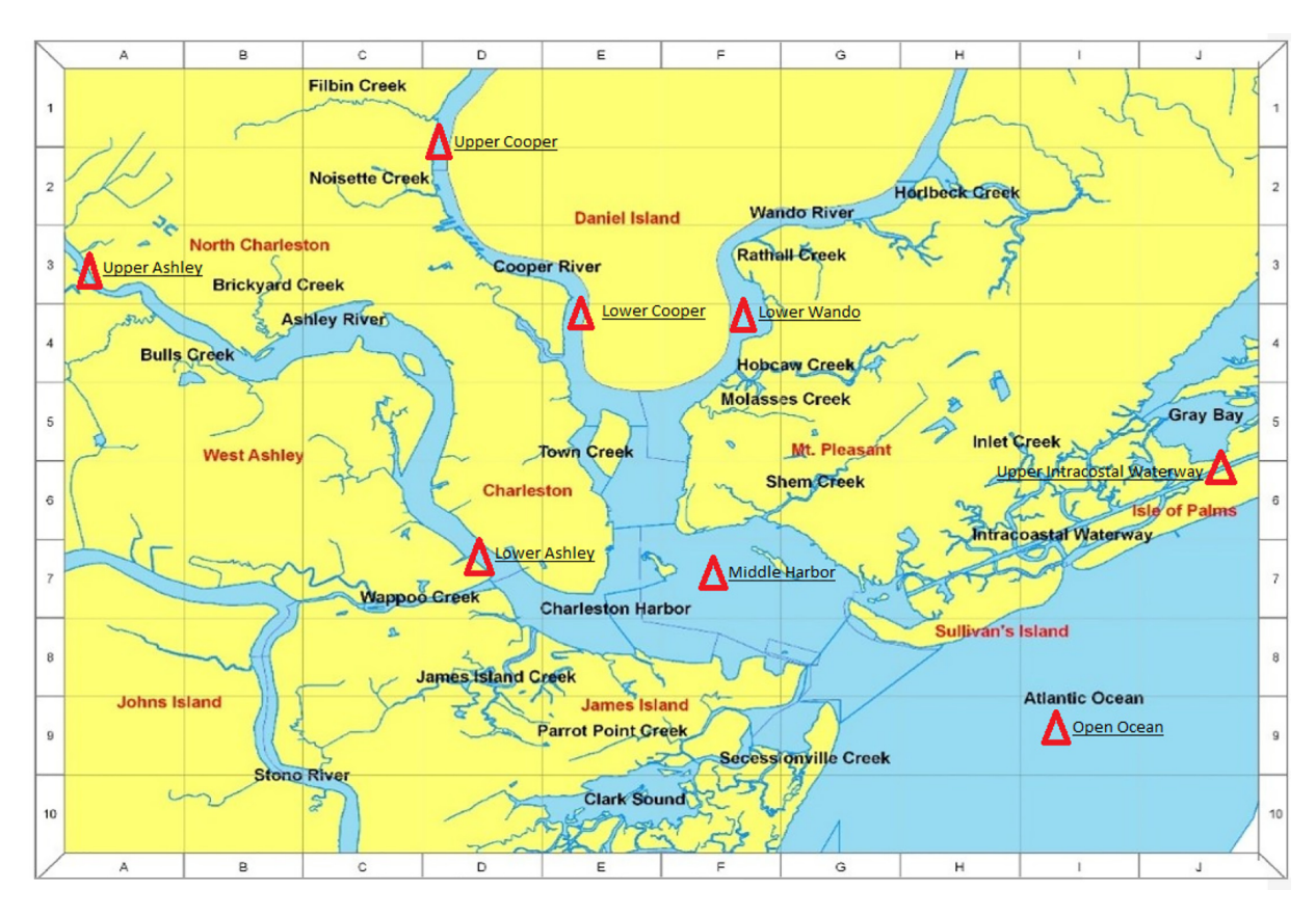
Figure 2. Map of the study area in Charleston and Berkeley with common fishing areas marked.

in the past year of each species compared to the CB group. This difference was only statistically significant for sheep-shead and croaker (P = 0.039 and P = 0.015, respectively). The frequency of consumption data for inshore gamefish is found in Table 2.