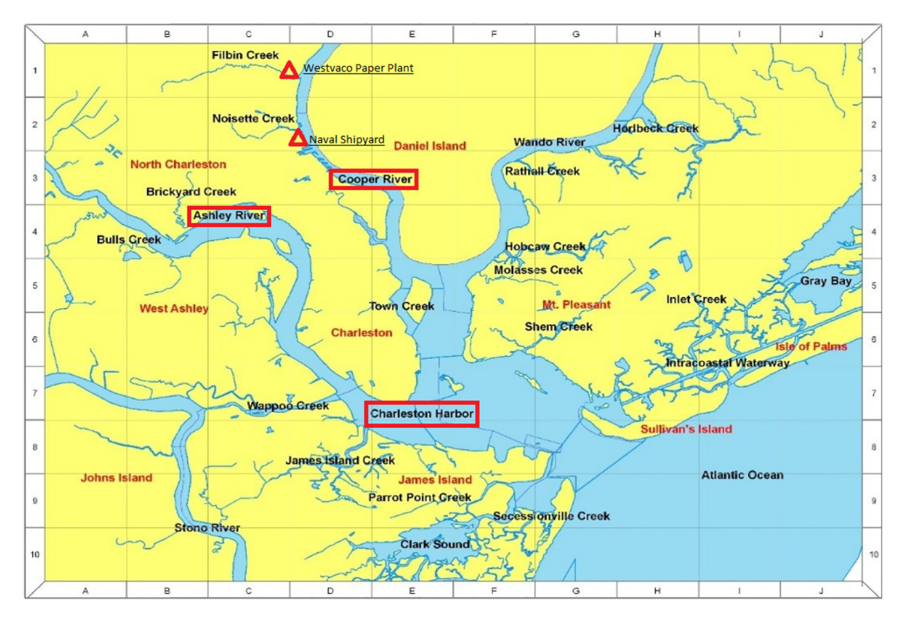
Figure 3. Areas indicated by anglers from which they would hesitate to eat fish.

Similarly, anglers cooked their fish using a variety of methods. Panfrying, deep frying, and grilling were the most common methods of cooking. As with fish preparation, very few of the anglers surveyed used one cooking method all of the time.