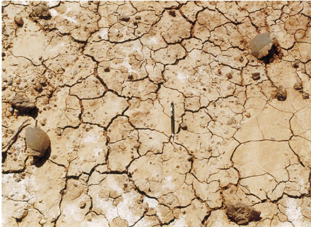
Fig. 4. Fragments of eggs and egg shell weathering out on the flats where the fossiliferous mudstone is exposed. Pencil is about 14 cm long.

ural rate of embryonic mortality. Interestingly, the eggs from this hillside quarry have not yet preserved definitive patches of fossilized skin casts, and the bed containing the eggs is relatively thin, less than 2 m thick.