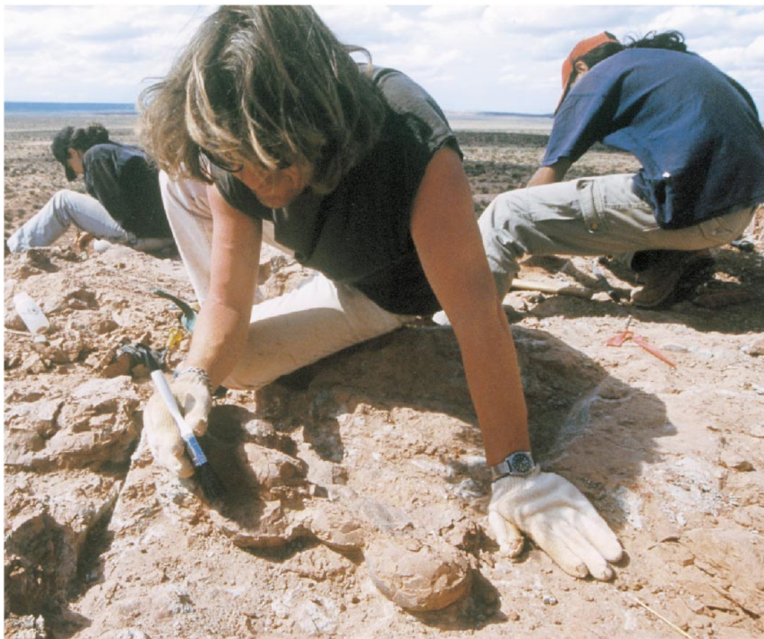
Fig. 5. Collectors excavating cluster of more or less complete sauropod eggs from quarry. Eggs are about 12–15 cm in diameter.

panian. No radioisotopic or paleomagnetic data have previously existed for the Neuquén Group. Age estimates for formations within the Neuquén Group have been based on constraining the age of the group as a whole, using the ages of over- and underlying strata. The Río Colorado Formation has been assigned the youngest age within this range because it is the stratigraphically highest formation in the group.