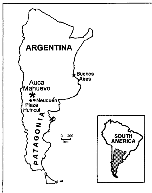
Fig. 1. Index map showing the location of Auca Mahuevo in Neuquén Province, Argentina.

This period constituted the second greatest period of subsidence in the basin's history (Manceda and Figueroa, 1995: fig. 3).