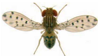
Drosophila guttifera differs from other fruit flies in that it has black spots and gray patches on each wing.

such as limbs, evolved independently through different genetic mechanisms. Now we know that the Distal-less gene is involved in the formation of all sorts of appendages across the animal kingdom.