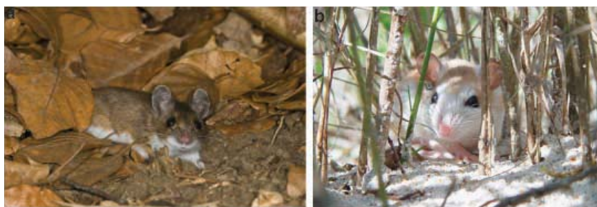
Dark, mainland oldfield mice such as the mouse on the left ( Peromyscus polionotus subgriseus ) are found in populations across the southeastern United States. Light beach mice ( Peromyscus polionotus phasma , right) blend into their native habitat on the Atlantic coast of Florida.

Many organisms use color for advertisement—for example, in mate choice, in mimicry, and as a warning. Oldfield mice exhibit extreme color variation among populations in the southeastern United States for a different reason: camouflage. Mice inhabiting inland, agricultural areas have dark brown coats to match the dark soil, but when some of them migrated to coastal dunes, their coloration evolved to a lighter color, allowing them to blend into the white sandy beaches. To determine the benefit of coloration for survival, Hoekstra's team placed