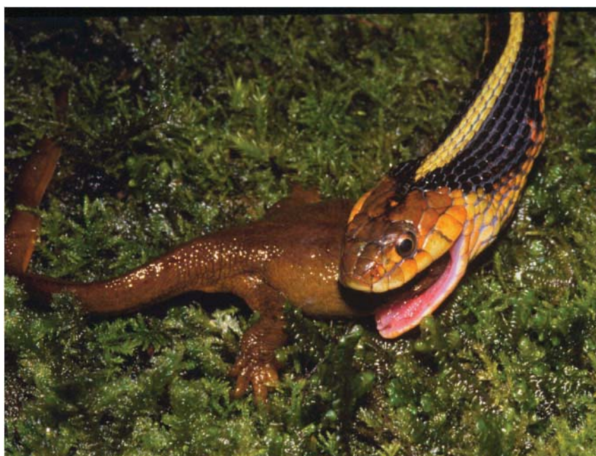
An adult garter snake (Thamnophis sirtalis) makes a meal of a toxic newt (Taricha granulosa).