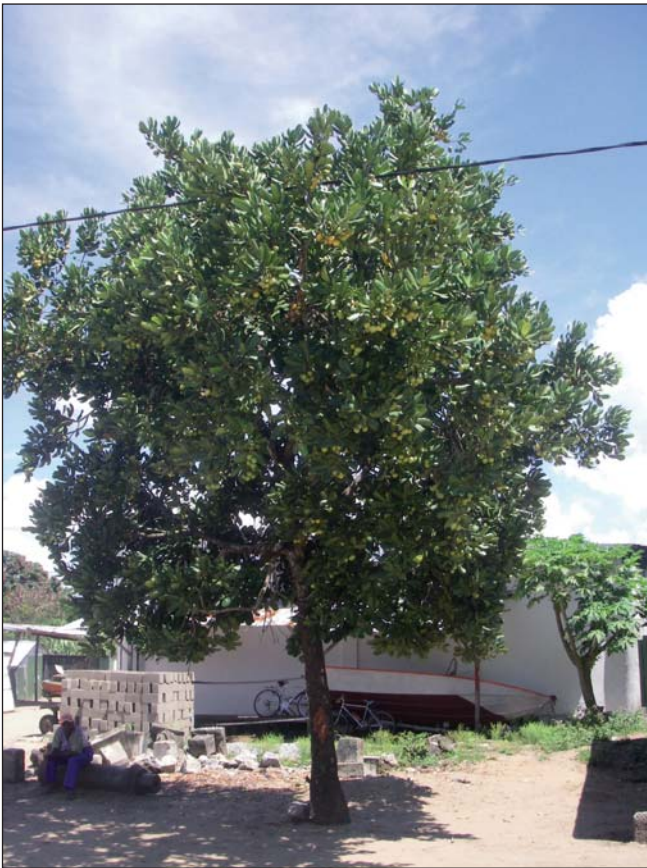
Fig. 4. – A tree of Mimusops coriacea (A. DC.) Miq. preserved in the city of Masoala, Eastern Madagascar.