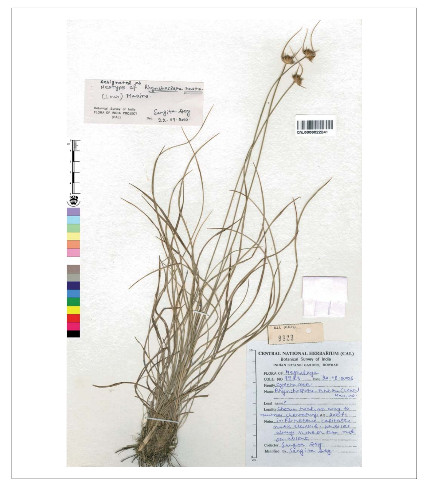
Fig. 3. – Neotypus of Rhynchospora rubra (Lour.) Makino.

[Sangita Dey 9923, CAL]