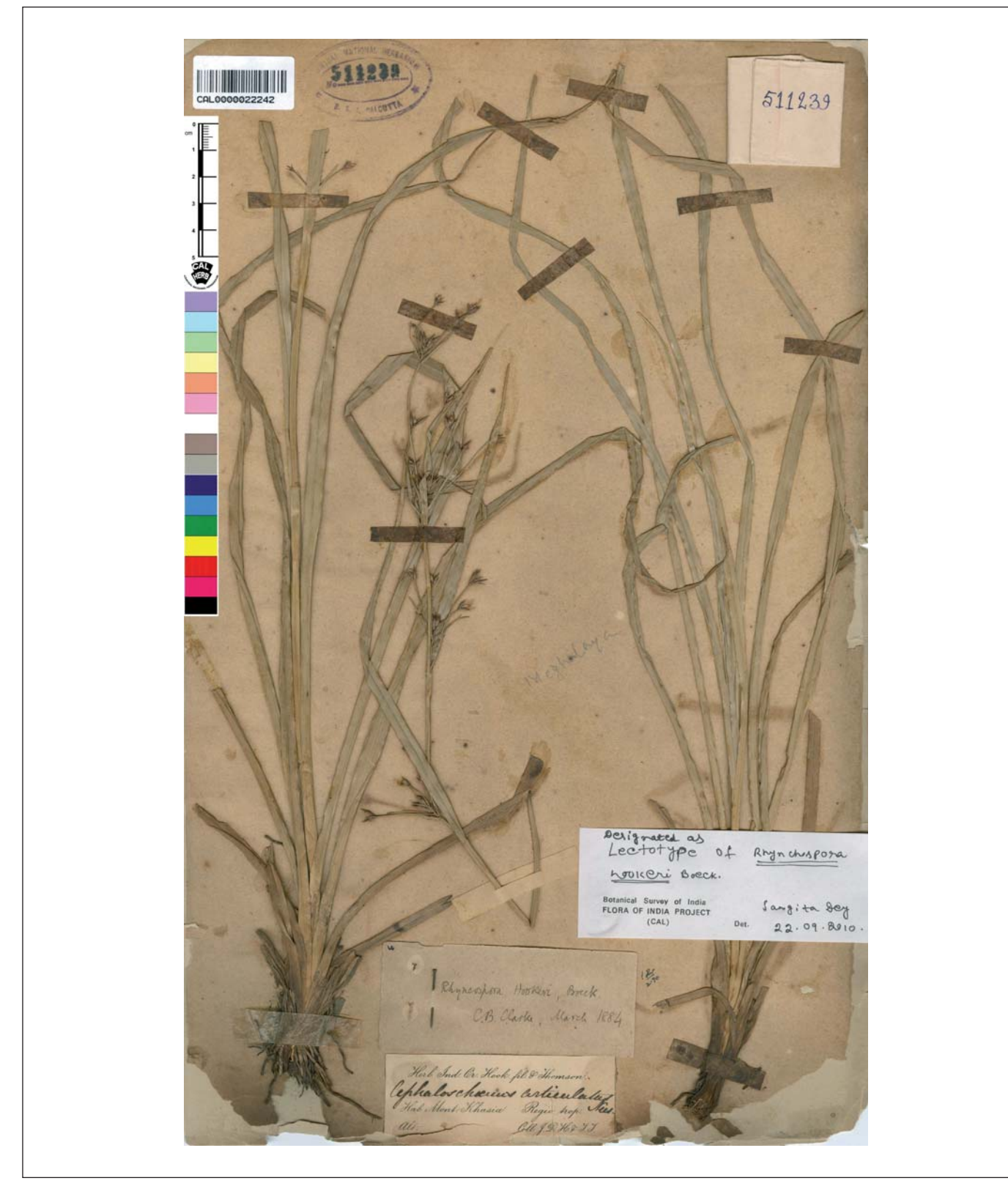
Fig. 1. – Lectotypus of Rhynchospora hookeri Boeck.

[s.coll., CAL]