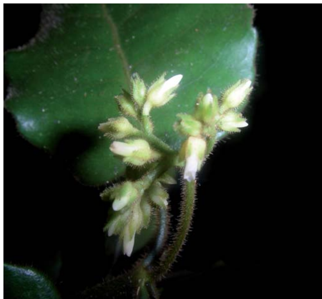
Fig. 2. – Inflorescence of Rinorea ranirisonii Nusb. & Wahlert. [Ranirison 496, P]

Remarks. – Rinorea ranirisonii is a distinctive species, yet it is not clear to which other opposite-leaved species in Rinorea subsect. Verticillatae it is most close related. With R. auriculata it shares a pedunculate cymose inflorescence (vs a contracted, subsessile inflorescence in most species), but is otherwise completely different in vegetative characters. R. ranirisonii differs from other species by the shape of its ovate leaf blade and the apex of the blade obtuse to rounded. It is also distinguished by its ovary covered in golden-reddish hispid indumentum, often densely so, as well as the young branches, upper and lower leaf surfaces, inflorescence axis, pedicels, and sepals.