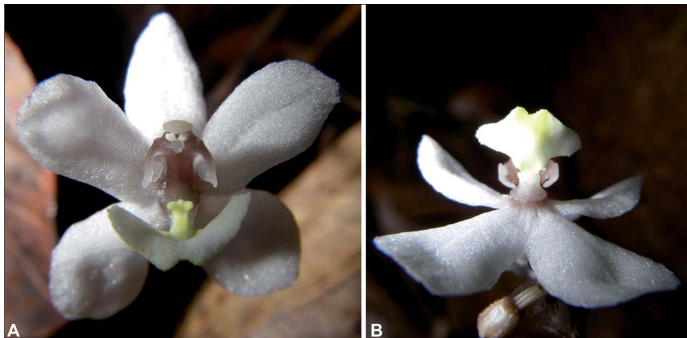
Fig. 4. – Didymoplexis recurvata P. J. Cribb, Nusb. & L. Gaut. A. Flower, front view; B. Flower from below, bud and pedicel.

[Nusbaumer & Ranirison 1763bis] [Photos: L. Nusbaumer, 12.XII.2005]