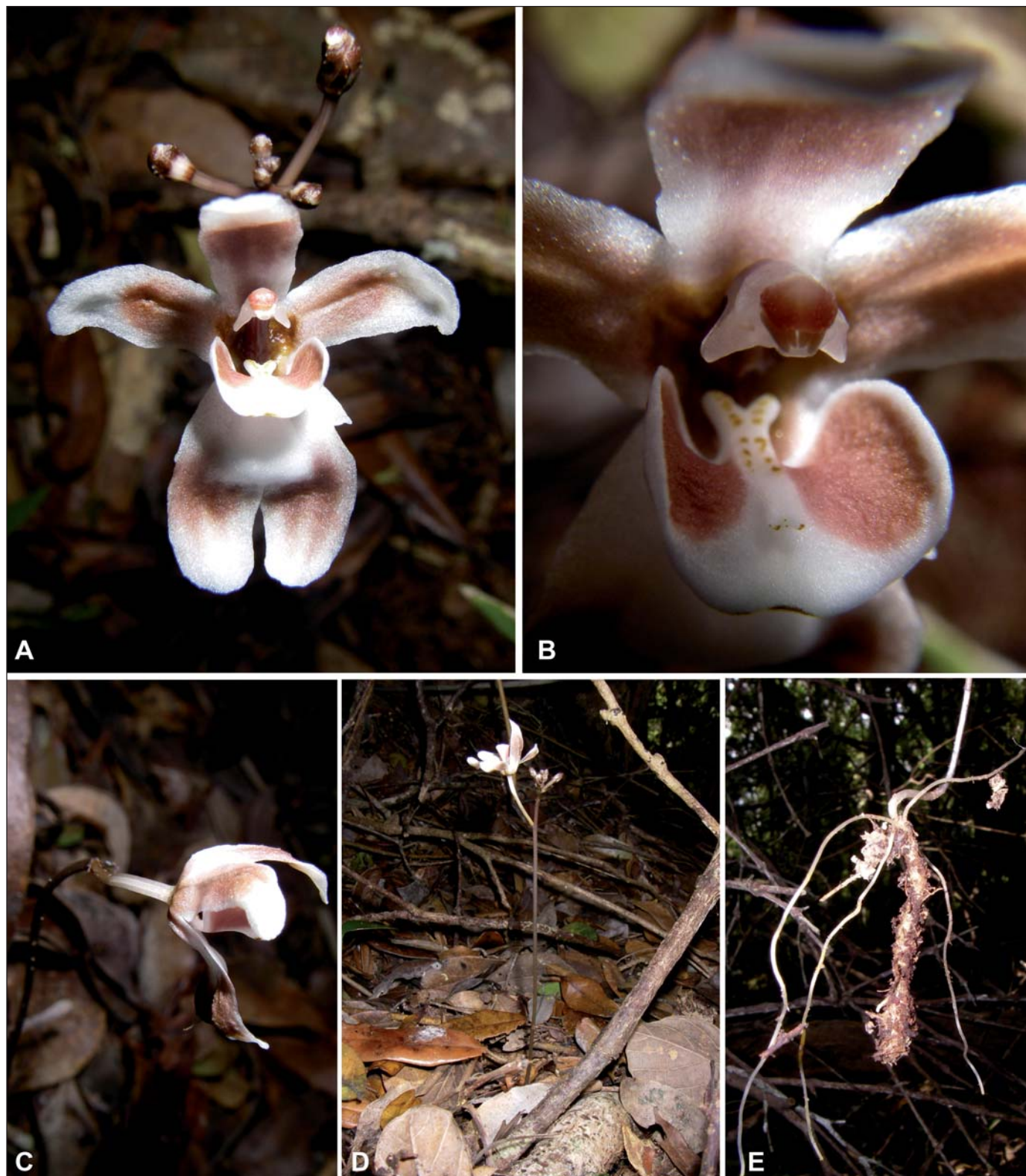
Fig. 2. – Didymoplexis avaratraensis P. J. Cribb, Nusb. & L. Gaut. A. Flower, front view; B. Labellum and column details, front view; C. Flower and pedicel, side view; D. Habit; E. Tuberous rhizome.

[Nusbaumer & Ranirison 1763] [Photo: L. Nusbaumer, 12.XII.2005]