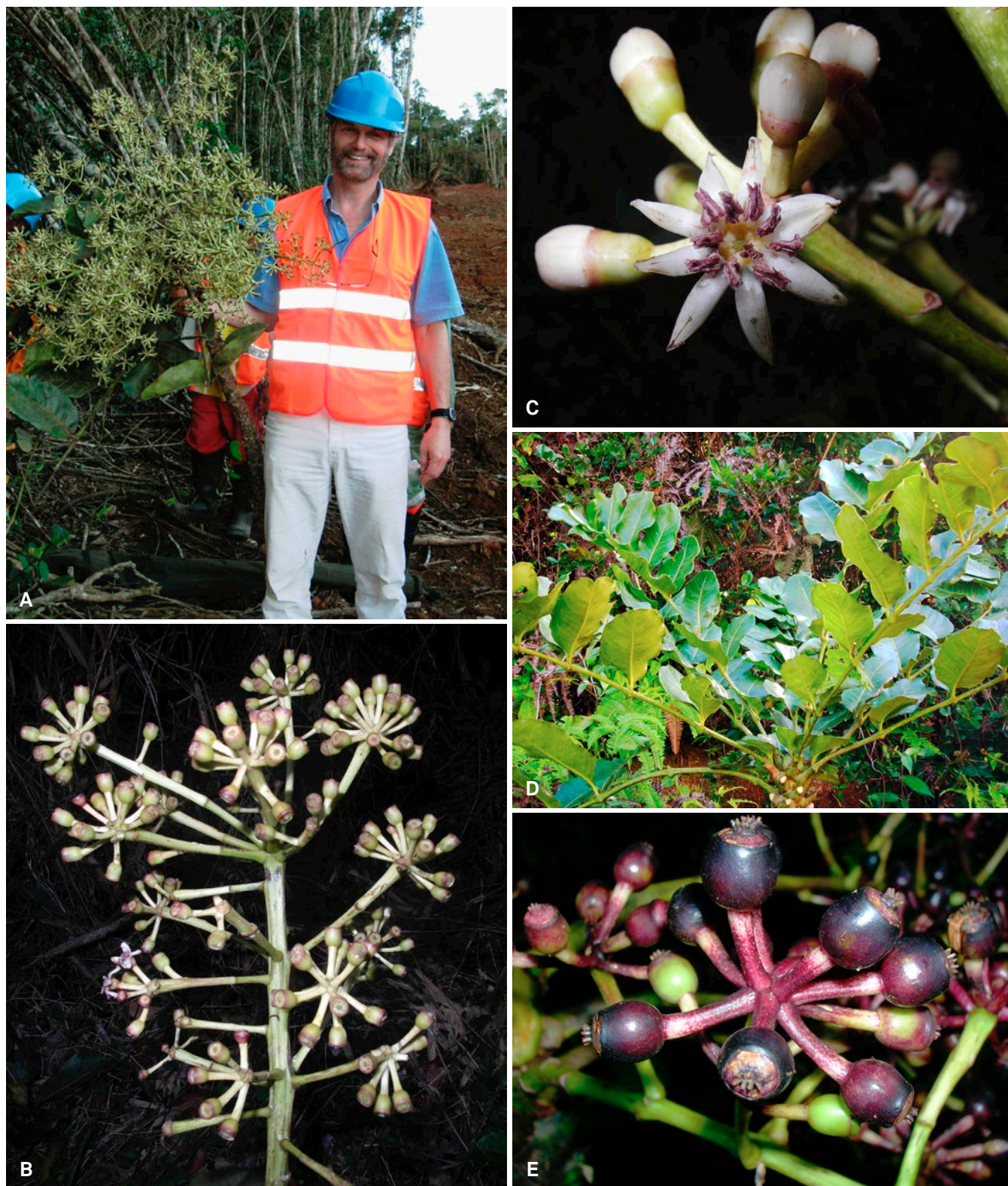
Fig. 1. – Polyscias bernardiana Lowry & Callm. A. Inflorescence held by the first author; B. Immature infructescence; C. Detail of a flower; D. Branch with terminal leaves; E. Detail of an umbellule with mature fruits.

[ A: Lowry et al. 7065; B–C: Rasoazanany 480; D–E: A. Randrianasolo 1109]