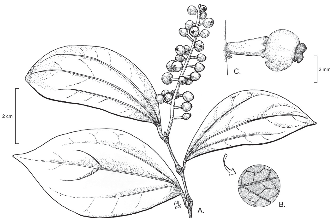
FIG. 3. Piper claseanum Bornstein. A. Branch with leaves and inflorescence. B. Abaxial leaf surface to indicate lack of pubescence and minute pellucid dots. C. Fruit with pedicel and associated bract. Drawn from field observations, pressed and liquid-preserved material from Bornstein et al. 1283.

vegetative condition appears similar due to the relatively small, leathery leaves with three primary veins and the numerous pellucid dots evident upon drying. They also share the unusual white fruit color, which appears to be a synapomorphy for these taxa. The two species can be easily distinguished because P. samanense has more densely packed flowers along the densely white-pubescent (vs. puberulent) rachis, the pedicels are shorter and broader, and only develop if the fruit matures (= pseudo-pedicellate), the fruits are more densely puberulent to pubescent, and the stigma lobes are quite narrow.