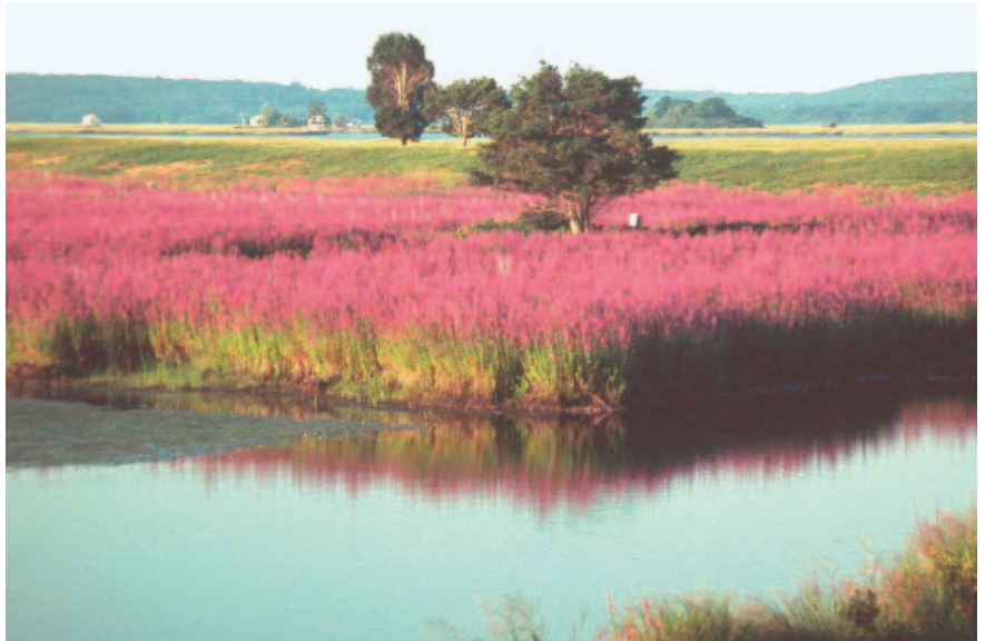
What are the consequences of invasions on ecosystems? Also called the “marsh monster,” purple loosestrife ( Lythrum salicaria ) takes over in wetlands, clogs irrigation canals, and can be nearly impossible to eradicate. This monotypic stand established in a freshwater impoundment at Plum Island, Massachusetts, in the Parker River National Wildlife Refuge.

For every hantavirus out there that kills, says University of New Mexico