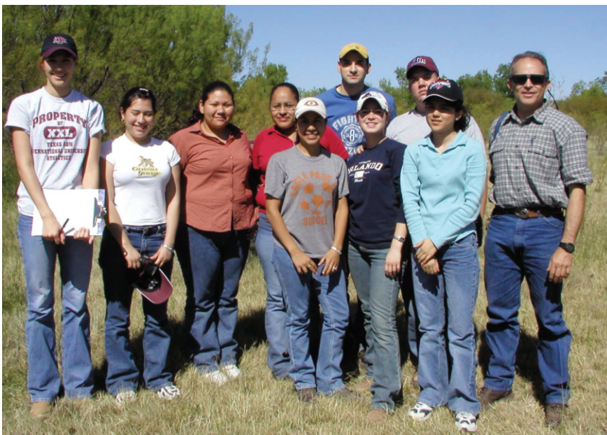
High-school students monitoring monarch butterfly larvae at Rio Bravo Park in Texas pause for a group photo. The monitoring project includes more than 600 sites from Minnesota to Texas and east to the Atlantic Coast.