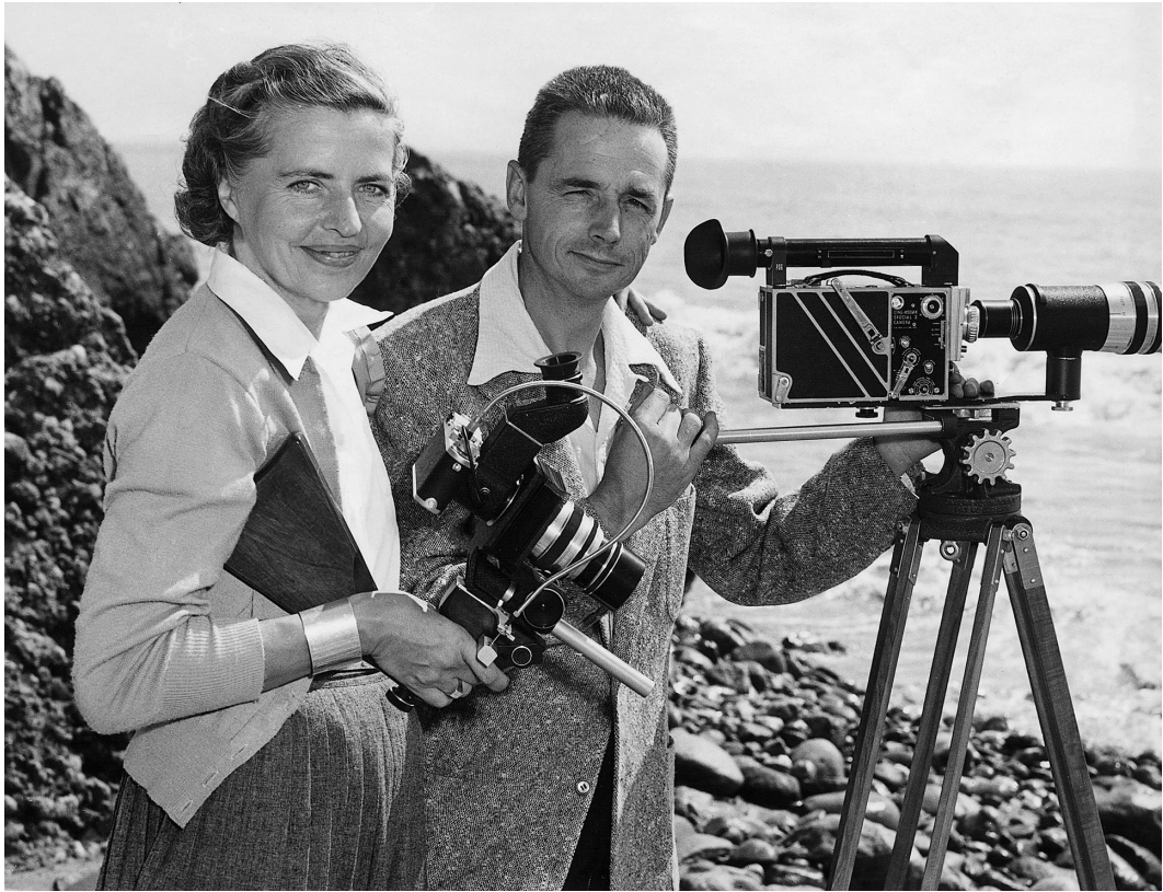
OLIN SEWALL PETTINGILL JR., 1907–2001

(Posing with Eleanor for publicity photo-shoot by Disney Studios in Santa Monica Beach, California, just prior to their departure for the Falkland Islands in October, 1953.)