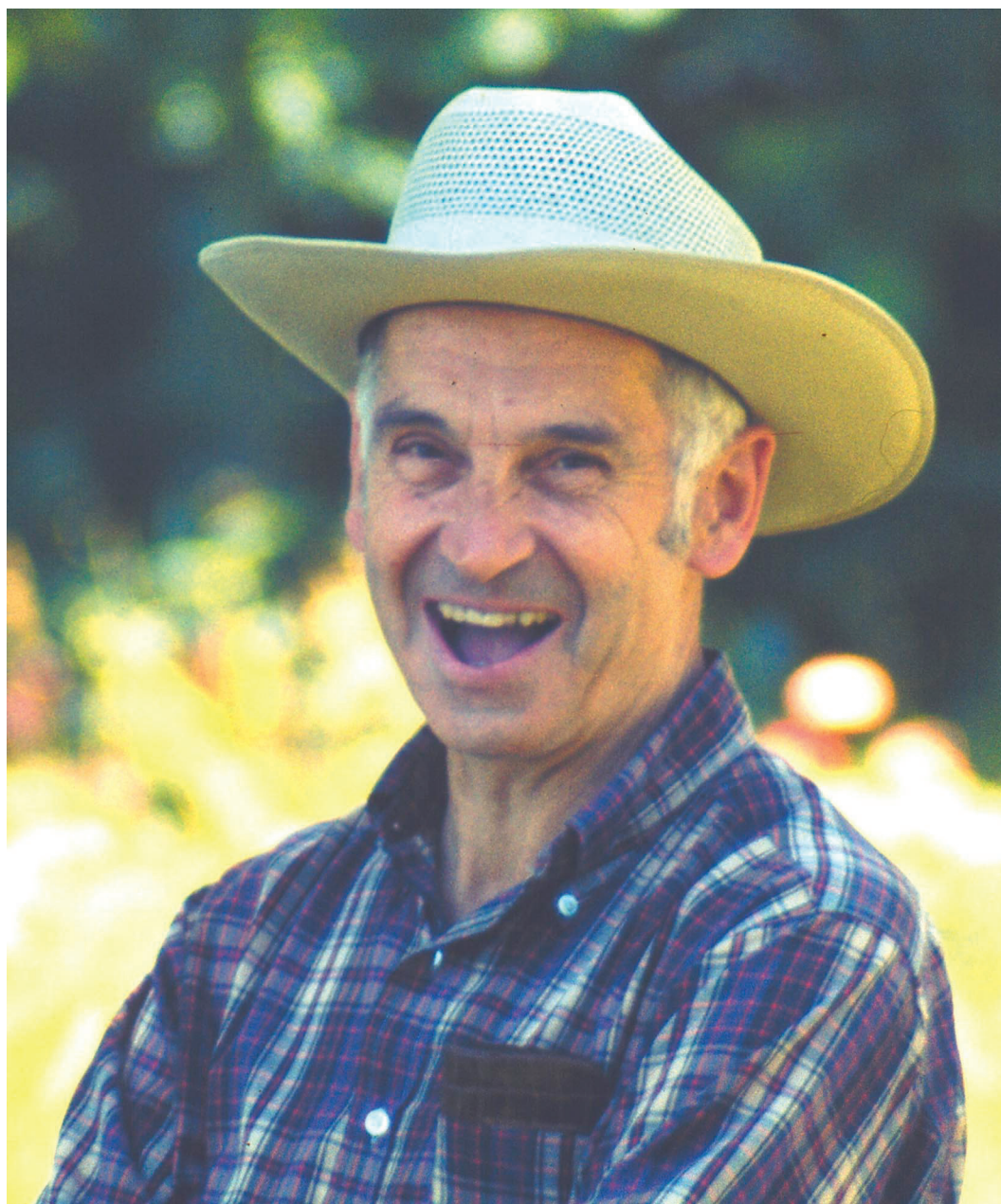
Ernst Mayr on his 67th birthday at his farm in Wilton, New Hampshire.