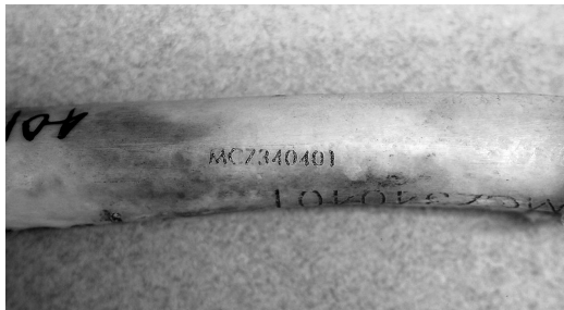
FIG. 2. Great Curassow ( Crax nigra ) MCZ 340401. Coracoid shaft marked by laser engraving. Note the traditional pen and ink numbering "401" that was applied over 100 years ago. The engraving "MCZ340401" is 8.5 mm long.

Recently, avian osteological material has served as a resource for research far removed