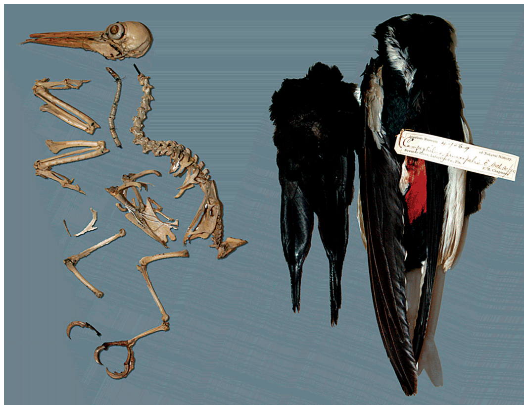
FIG. 2. Skeleton (AMNH 4708) and flat, folded dry pelt (AMNH 49569) of male Ivory-billed Woodpecker collected by Frank M. Chapman in Florida on 24 March 1890. Notice detached tail.

pattern, also allows for comparative study among members of Picidae, such as the sympatric Pileated Woodpecker ( Dryocopus pileatus ; Fig. 4).