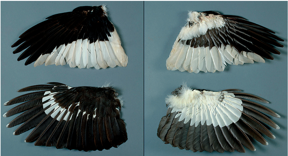
FIG. 4. Dorsal (left) and ventral (right) surfaces of left wing of male Ivory-billed Woodpecker (above) and Pileated Woodpecker (below).