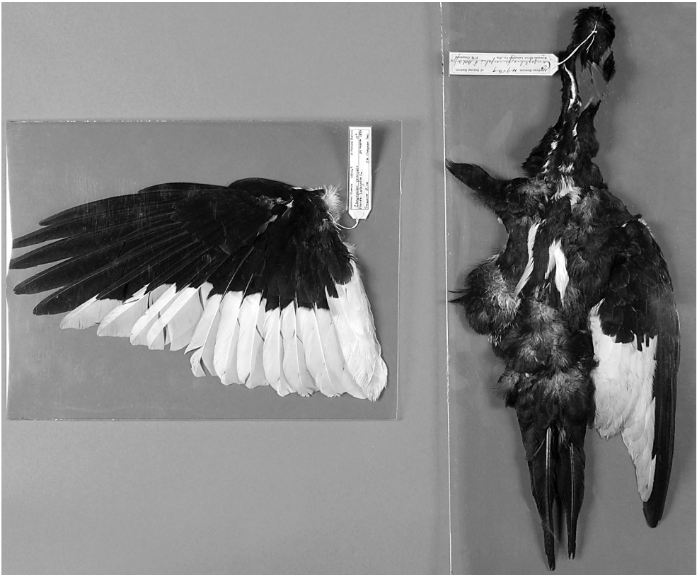
FIG. 3. Detached, extended wing and relaxed pelt of Chapman's Ivory-billed Woodpecker specimen in protective Mylar envelopes. Notice reattached tail.