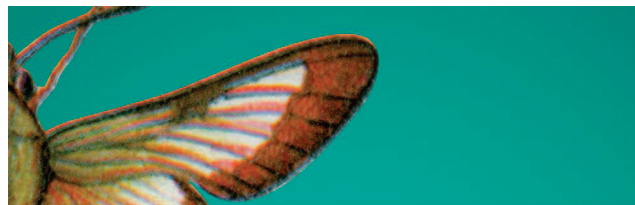
Insects, Pterosaurs, Birds, Bats and the Evolution of Animal Flight

own type of flight muscle, whose contraction frequency is not limited by the mechanics of the wings that they flap. Insect flight muscles produce rather little power but work well at frequencies higher than those of vertebrates, into