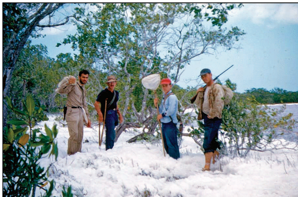
Fig. 1. George Rabb (far left) with colleagues on Great Inagua during the Bahamian Island expedition in 1952–1953. The white foam was blown in from the salt pond to the right. This is Figure 5 in Rabb and Hayden (1957).

collecting localities and making collections of insects (45,927, 17 orders), amphibians (684, 2 genera), reptiles (2106, 12 genera), and mammals (67, 4 genera). The extensive trip report was written by Rabb and entomologist Ellis Hayden (1957). In his typical style of understatement, George managed to include this line in the report (p. 18): “Daytime collecting was done in the morning and latter half of the afternoon, as midday was often too hot for insects, reptiles, and collectors.” Later, a line hints to traditional misadventures of field work (p. 25): “...except that on the latter day our pursuit of the numerous little geckoes ( Sphaerodactylus ) under fallen palm fronds was quickly halted when we uncovered several wasp nests.” or misadventures not so familiar to herpetologists (p. 26): “Later, while attempting to enter a shallow harbor near Hawks Nest Point, we went aground on a reef, but luckily a near-by construction crew pulled us off with their barge.”