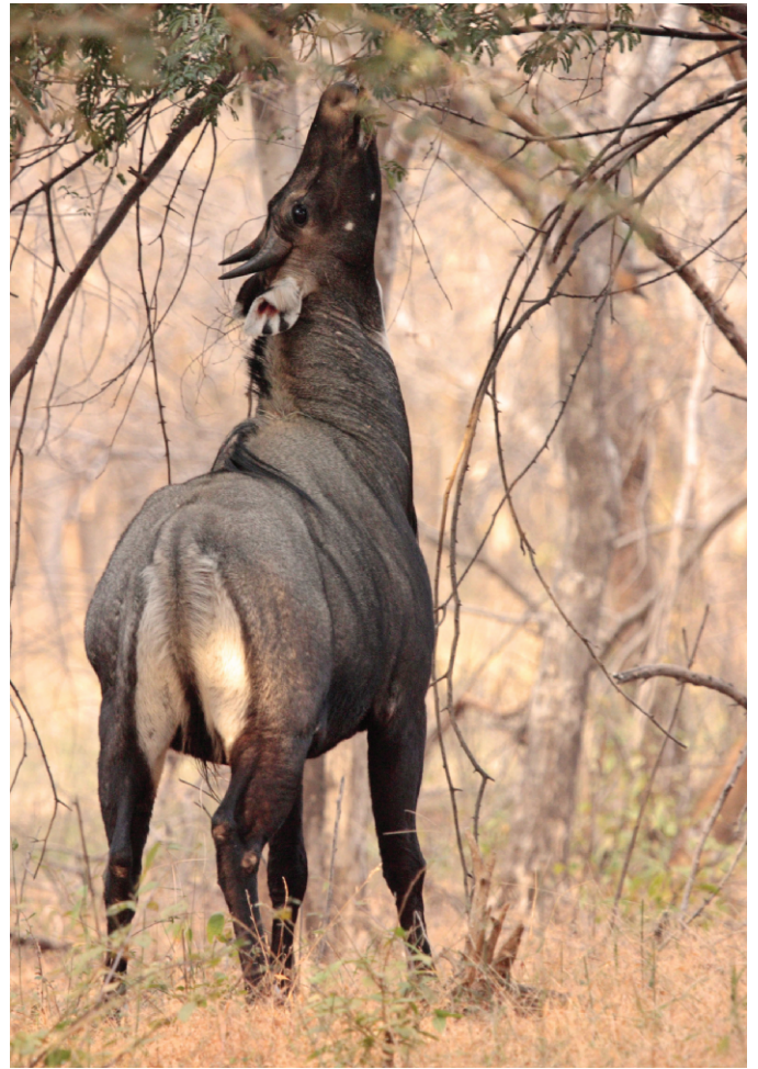
Fig. 5. —Male Boselaphus tragocamelus reaching for leaves of woody vegetation in Ranthambore National Park, Rajasthan, India, December 2004; browse is seasonally important in the diet in India and southern North America; note the characteristic “hogmane” at base of the neck.

Maximum life span is 12–13 years in the wild (Berwick 1974; Mungall 2000; Mungall and Sheffield 1994) and 20–21 years in captivity (Grzimek 1990; Jones 1982); 1 female born at the National Zoo, Washington, D.C., lived 21 years and 8 months (Weigl 2005). Survival patterns among male and female B. tragocamelus are similar to those of other ungulates (Brown 1976) but vary depending on population density and status of particular populations, either on native or introduced range (cf. Berwick 1974; Sheffield et al. 1983). High rates of mortality are common for males in particular, but also females, before age 3 (Berwick 1974; Brown 1976). In Gir Forest, India, 34% of calves die each year, and there is a general linear decline of 52% of 2–10-year-olds of both sexes (Berwick 1974). In southern Texas, mortality of both