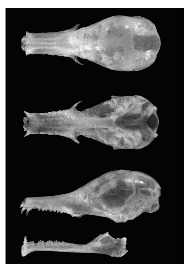
Fig. 2. —Dorsal, ventral, and lateral view of cranium and lateral view of mandible of an adult female Choeroniscus minor (ZMH [Zoologisches Museum Hamburg, Universität Hamburg] 9301), collected in 1982 by E. Patzelt from Rio Cuyabeno, Ecuador. Greatest length of skull is 22.50 mm.

fossae are well defined, rather deep and long, and are separated from each other by a wide portion of the skull base. Mandible is long and narrow and the coronoid process is short, barely projecting beyond the articular process. The mentum has a marked symphyseal projection.