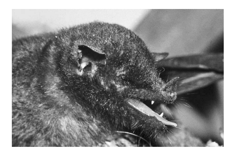
Fig. 1. —An adult female Choeroniscus minor from Rio Cuyabeno, Ecuador, collected in 1982 by E. Patzelt (Zoologisches Museum Hamburg, T 1380).

NOMENCLATURAL NOTES. The genus name Choeroniscus with minor as its type species was introduced in 1928 by Oldfield Thomas for the "normal headed species" that included minor , intermedia , inca , and godmani , thus separat-