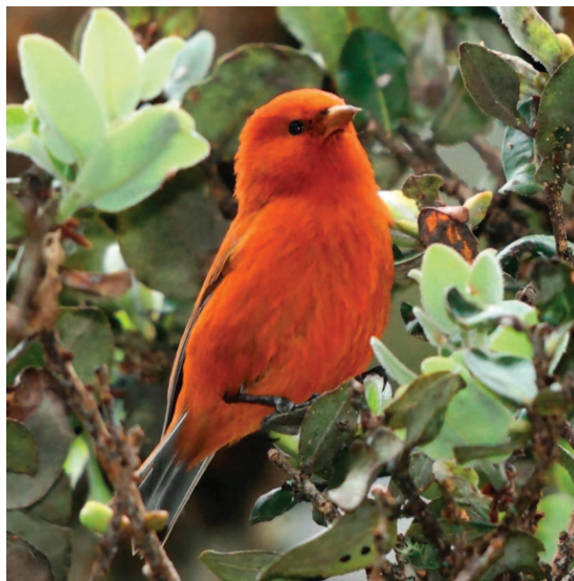
FIGURE 1. Male Hawai'i 'Ākepa ( Loxops coccineus coccineus ). These endangered Hawaiian honeycreepers are 1 of only 18 extant species from more than 50 Drepanidinae that evolved in the Hawaiian Islands. This specialist insectivore is found only in montane old-growth forest on the island of Hawai'i and uses its crossed bill to open leaf buds and expose the insects, primarily microleps and spiders, on which it feeds.

We used the standard statistical procedure of log-transforming population densities to control error variance (Neter et al. 1996). Although residual plots are useful for assessing whether the variance of the error terms is constant, their interpretation is somewhat subjective, and concluding definitively between residuals expressing a pattern or providing an adequate fit can be difficult. This is especially true of our time series with fewer than 30 points. Therefore, we used the modified Levene test to provide a